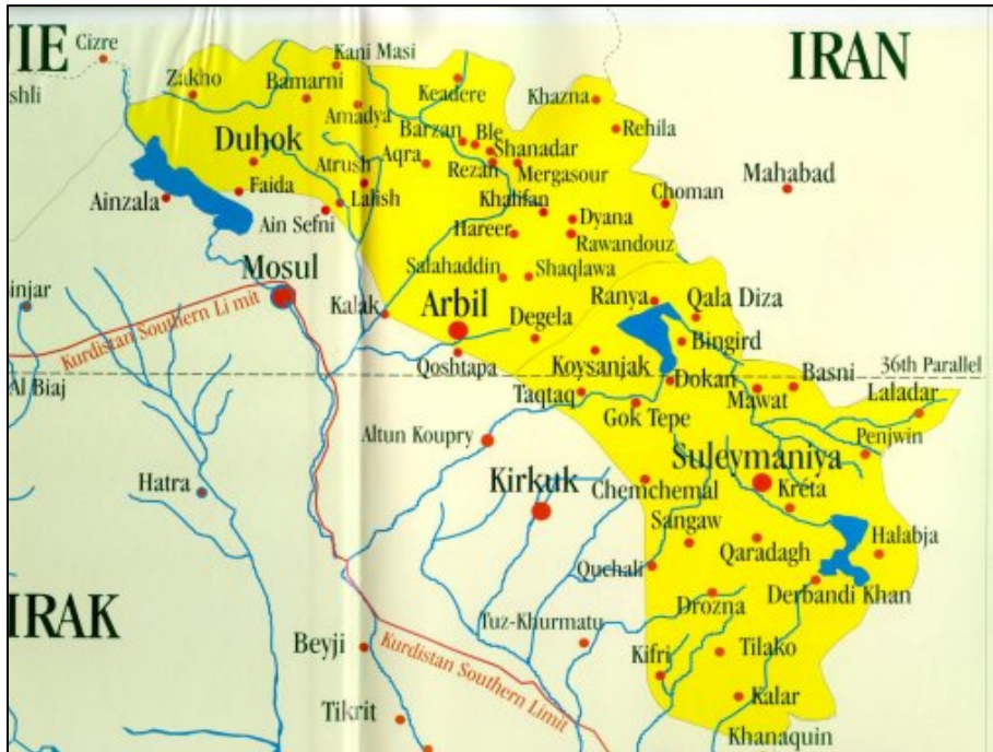
1.09 Global Security Map, last modified 24 February 2006. [83a]