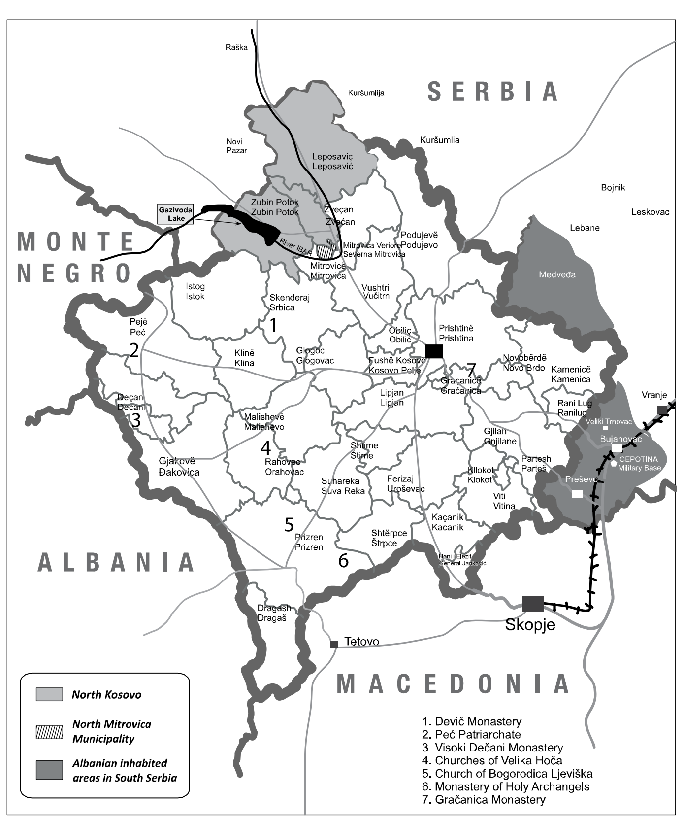
Adapted by Crisis Group