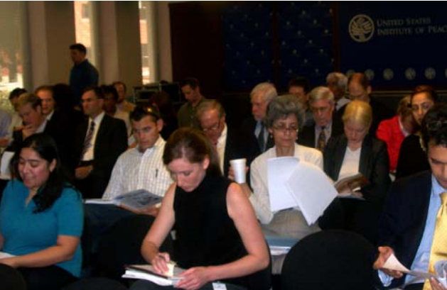
A cross-section of participants at the panel discussion in Washington DC

"With the spectre of violence and uncer-