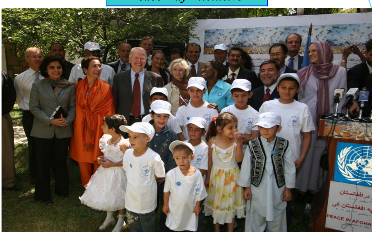
The UN SRSG, Tom Koenigs seen with children and Heads of UN Agencies in Afghanistan at a special function to express commitment of the UN System to observance of Peace Day activities in the country.