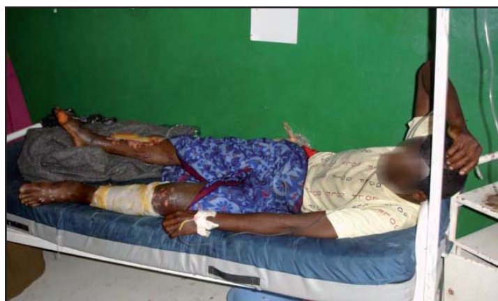
A victim of the 5 February bomb blast in Bossaso recovering at the Bossaso hospital. A bomb exploded at a site where Ethiopians waiting for the opportunity to cross to Yemen lived. International Office for Migration is in Bossaso to discuss and handle the relocation of the victims and possible transfer of those in need of further treatment to a hospital in Addis Ababa.

On the evening of 5 February, a powerful explosion ripped through a densely