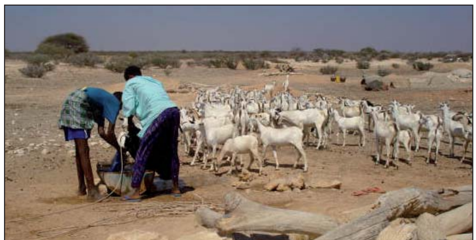
Drought conditions in Somalia's central regions of Galgaduud, Mudug and have forced thousands of people and animals to travel for miles in search of water. Most wells have run dry while those remaining cannot serve the population.

zones respectively, leaving people vulnerable to outbreaks. This region is also hosting the second highest number of new IDPs (170,000) after the Shabelles (200,000). Given that the next rainy season is not expected to start until April, the situation is expected to worsen for at least another month and massive intervention is required.