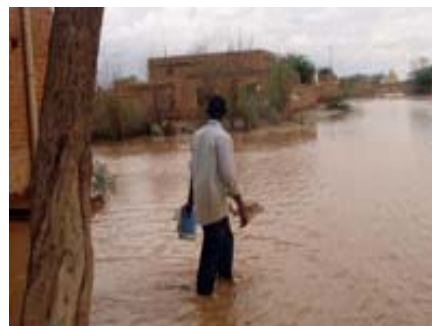
Flooding in Kassala

The international NGO Plan International (PI) reported this week that exceptionally heavy rains and flash floods had destroyed many villages in Kassala and White Nile states. PI also reported that many affected people in these states are unable to access food, water, electricity, and health services, while access to most of the affected communities remains a challenge.