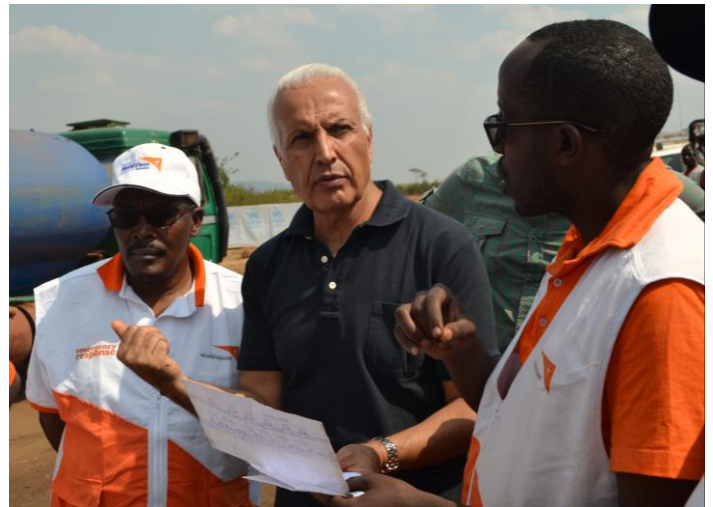
The UNHCR Representative and World Vision Country Director inspect 10,000-liter water tankers that filtrate river water for use by residents of Mahama camp.