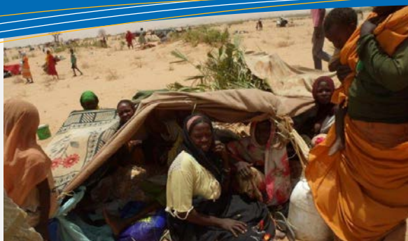
New IDPs from Muhajeria without shelter in Kalma IDP camp