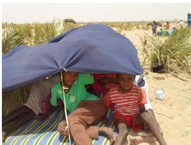
Children displaced from Muhajeria in Kalma IDP camp

The total number of new IDPs is estimated by community leaders to be about 16,000 people. IOM has started the verification of new arrivals and had verified some