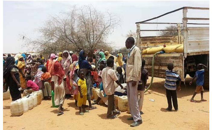
New IDPs from Muhajeria in El Neem IDP camp queuing for water

Many people in East Darfur are still on the move following the fighting in Labado and Muhajeria that started on 6 April when rebel forces from the Sudan Liberation Army-Minni Minawi faction (SLA-MM) attacked the two towns. The SAF re-took the towns around 20 April, but due to continuing tensions in the area civilians have been moving to other locations, including camps, primarily due to security concerns.