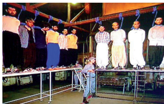
A scene of group executions in 2008 on Iranian TV screen

During the first years after the revolution, many prisoners were executed by firing squads inside prisons or in the case of Kurdish rebels outside the cities. Some were hanged from cranes or from bridges or on the streets and in the main squares, which remains a frequent practice. However, many prisoners are hanged inside prisons nowadays. Death-row prisoners may also be sentenced to flogging, in which case the flogging is administered before they are executed.