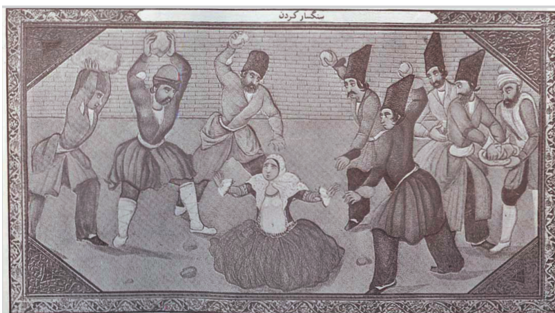
A cartoon of stoning in Iran in the Qajar era about 200 years ago; from a book by Charles James Wills

Under the Islamic Penal Code, it is an extremely difficult task to prove fornication/adultery. It may be proved if an offender confesses four times before a judge or by testimony of “four just men or three just men and two just women” 125 who should have witnessed the exact action of penetration in sexual intercourse between a man and a woman. Less than four confessions by the defendant will lead to another punishment, possibly flogging. Furthermore, a judge may request that the Supreme Leader pardon a fornicator who confesses to fornication and then repents his/her action. There are other qualifying conditions, the absence of which should theoretically lead to annulment of testimonies and the dropping of the charge of fornication or adultery 126 . Judges are, however, empowered to rule on the basis of their own “knowledge” in various cases. Hence, a good number of stoning as well as other sentences are issued on the basis of the “knowledge of the judge”. This is illegal even according to the letter of the Islamic Penal Code 127 .