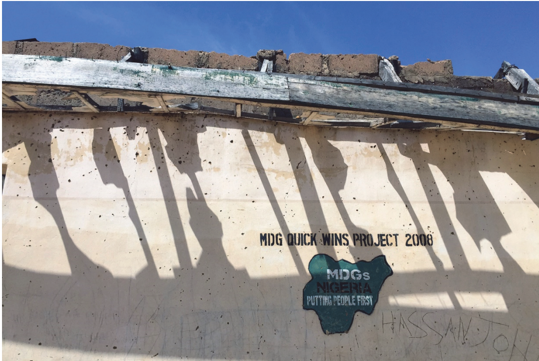
A block of classrooms at Nahuta Primary School, Potiskum donated as part of a project for the Millennium Development Goals was destroyed during Boko Haram attacks in Potiskum, Yobe state, in October 2012.

Between June and October 2012, schools in Damagun, Damaturu and Potiskum, Yobe state, bore the brunt of Boko Haram attacks. 64 Yobe Children's Academy was the first private school to be attacked in Damaturu. On the night of July 22, insurgents burned 32 classrooms and nine offices in the primary and secondary section. 65 A teacher working late in the office was shot and killed after being forced to show the insurgents around the school. 66