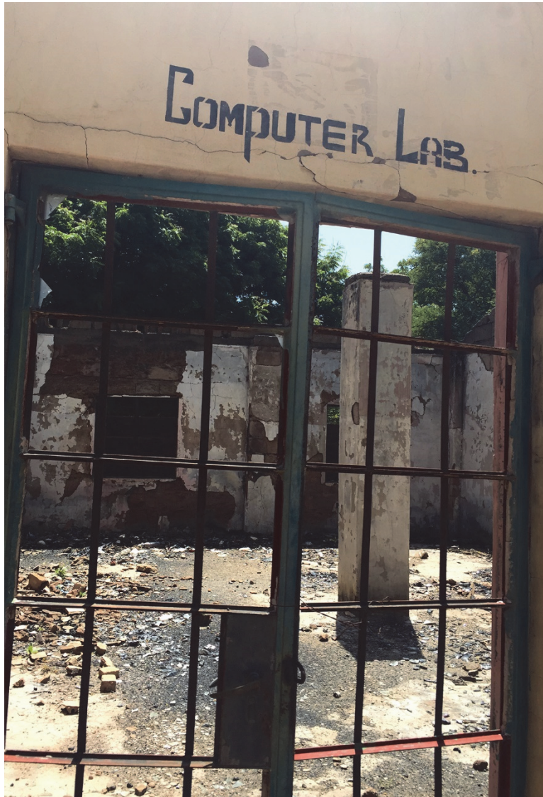
Computers and a computer lab supplied by a project for the Millennium Development Goals are destroyed when Boko Haram attacked Nahuta Primary School in Potiskum, Yobe state.

the local education authority office, and at least eight schools including Race Course Primary School, Nahuta Primary School, Sabon Layi Primary School, Government Day Junior Secondary School, College of Administrative and Business Studies, and Best Center Vocational School. 67