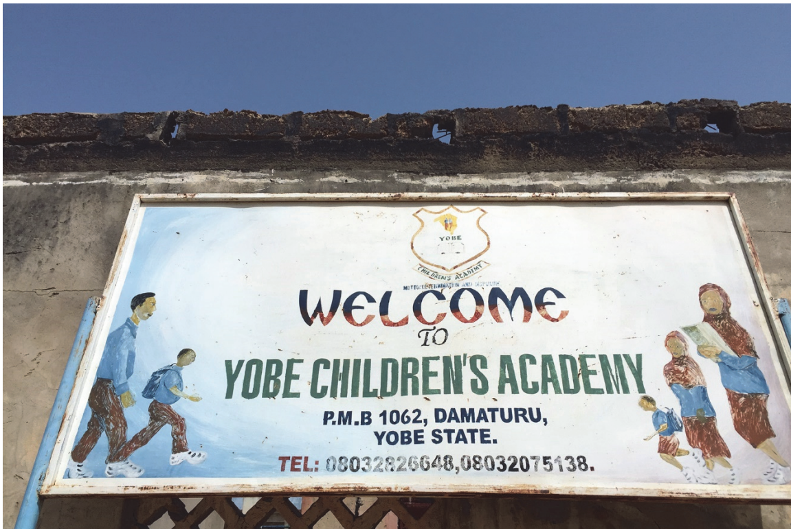
Figure 1A sign welcoming children to Yobe Children's Academy, Damaturu, Yobe state. The school was attacked by Boko Haram in July 2012 leaving one teacher dead and 32 classrooms and nine school offices destroyed by fire. It reopened three months later with only a only a quarter of the student population.

The United Nations Office for the Coordination of Humanitarian Affairs (OCHA) estimates that 1 million children affected by the Boko Haram insurgency are in urgent need of education. 194 The devastating effect for the future of these children out of school and their lost years of education will be a huge challenge for the government to rectify.