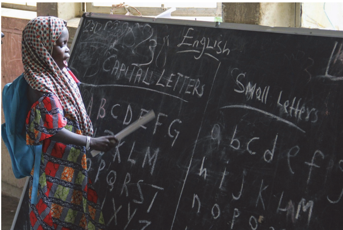
An eager student leads her class in learning the alphabet in September 2015 at a displacement camp housed at a school in Maiduguri, Borno state.

Our education secretary arranged us. Told us that these children running about all day doing nothing is not so great. So we must go and teach them. We are just managing. ...Some of the students are too small. Some are having 5 years to 6.5 years..... 248