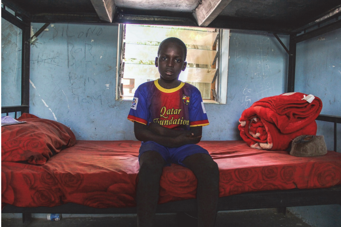
A boy at the Kano school for children orphaned by the Boko Haram conflict. The Kano state government “adopted” 100 orphaned children from Borno in April 2015.

implementation has faced serious challenges. 9 Four years of senior secondary for children aged 15–17, and four years of tertiary education completes the nation’s formal education system. 10