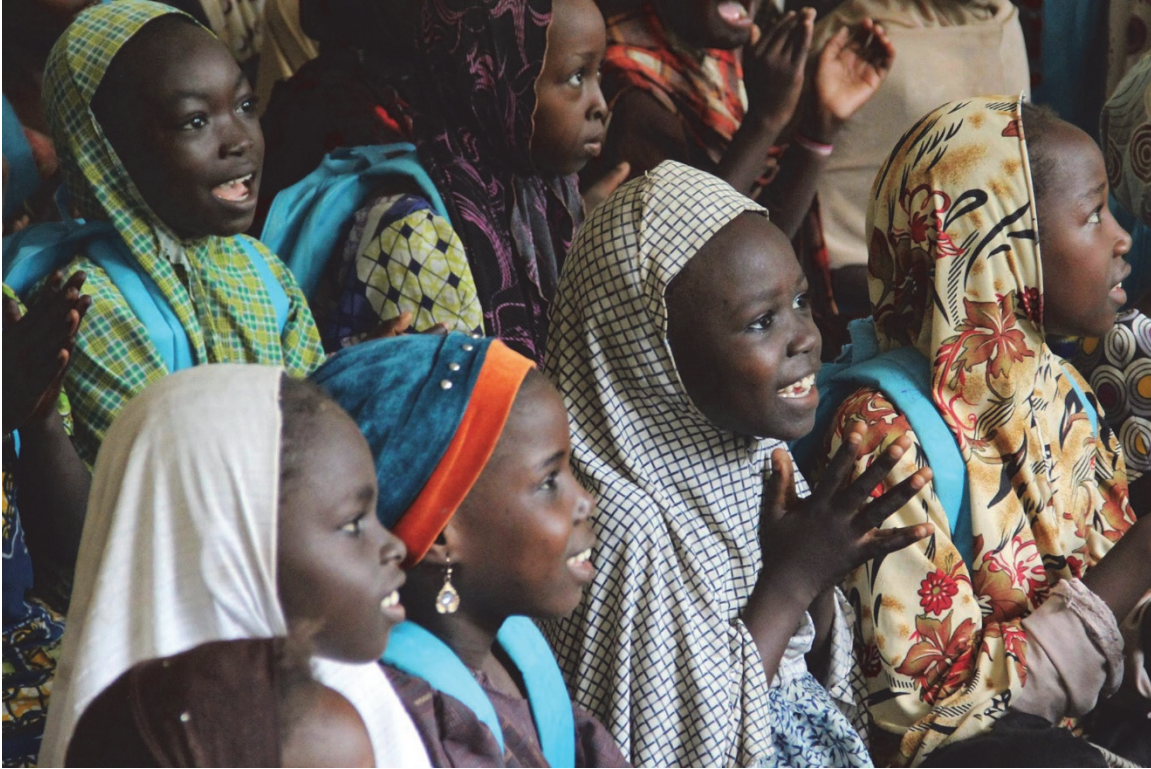
Internally displaced children attending classes at a displacement camp in Maiduguri, Borno state, September 2015.