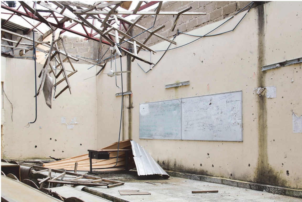
A lecture theatre at the Federal College of Education, Kano, Kano state, destroyed when Boko Haram insurgents lobbed grenades and shot students taking classes on September 17, 2014. At least 27 students and two lecturers were killed in the attack.

caused by the massive crackdown on its members by security forces in late 2012, the group embarked on large-scale recruitment of students and others using hefty financial rewards as enticement and brutal force. 54 The recruitment was accompanied by killings of those who refused or who attempted to evade capture.