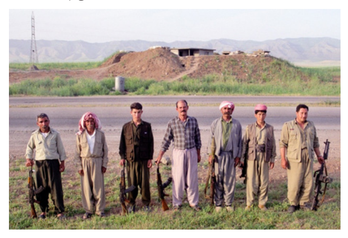
Yezidi men serving in the Peshmerga forces, Dohuk Governorate, Kurdistan Region of Iraq (1998).

In the 2014 attacks, thousands of people fled up rocky and inhospitable mountainsides in an attempt to escape the onslaught by the extreme and violent Sunni group Islamic State, which is largely comprised of Iraqi Arabs but has also attracted Sunnis from many other backgrounds and countries. Thousands of Yezidis died or were killed, many of them adult men who were singled out and executed. According to media reports, word of mouth and social media accounts, several thousand more Yezidis remain in captivity, where they are sexually and otherwise abused.