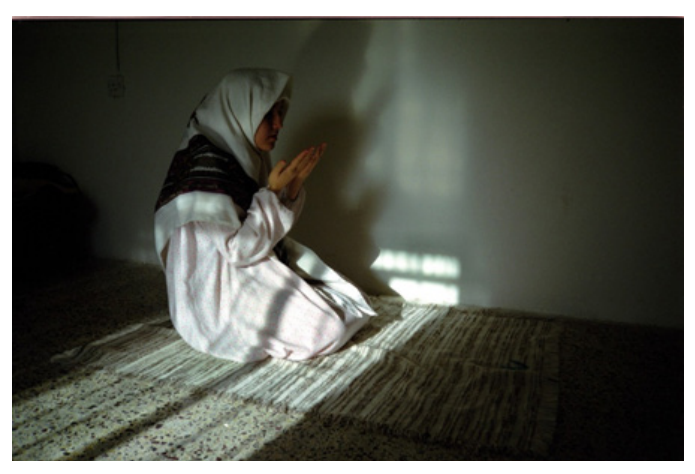
A teenage girl performing Salat, the Muslim prayer, in her home in Dohuk, Kurdistan Region of Iraq (1995).

Islam. However, Jewish influence is still felt in some cities and rural communities, and in those places, people still speak of the Jewish community that existed until a few decades ago. One point about faiths has been made repeatedly: adherents need non-adherents to help them with their rituals: Muslims helping Jews on the Sabbath, Yezidis helping Muslims at their circumcision ritual, and so on. To some degree, this interdependency still exists.