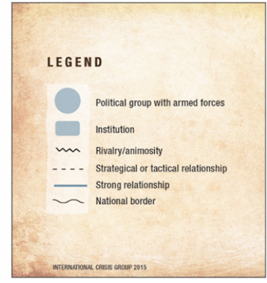
Kurdish political scene 201563

The divide between these two blocs reflects the power struggle between KDP-leader Masoud Barzani and PKK-leader Abdullah Ocalan, who are the two primary poles of Kurdish political power. Barzani, on the one side, is the only Kurdish leader who managed to lead an effectively functioning autonomous region for Kurds. Ocalan, on the other side, has been imprisoned since 1999 and his organization has been declared illegal. Particularly the military achievements of the PKK-associated PYD in Syria, as well as the success of the partially PKK-associated Kurdish party HDP in the June 2015 election for the Turkish Parliament have strengthened the standing of the PKK at the expense of the KDP. The animosities between the PKK and the KDP date back partly to the parties' military confrontations of the past as well as to their ideological roots. The PKK has a Marxist-Leninist history, whereas the KDP is a more tribal and pro-capitalist party.<sup>64</sup> Ocalan and Barzani both aspire to be the icon of the ambitions of the Kurdish people for independence and consider allying with Western players as critical to realizing this goal.