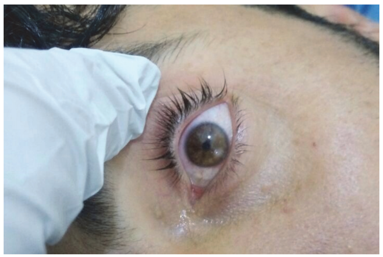
Severely constricted ("pinpoint") pupil of a man injured in attack near al-Lataminah on March 30 according to the Syrian American Medical Society.

The Syrian American Medical Society (SAMS) provided a photo that it said was of one of those injured in the March 30 attack on al-Lataminah. The photo shows that the man has severely constricted ("pinpoint") pupils.