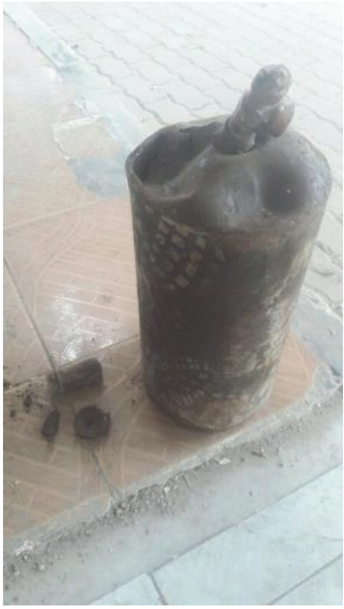
Deformed gas cylinder that a Syria Civil Defense member said was found at the site of a March 29 attack in the Qaboun neighborhood in eastern Damascus, which is controlled by armed groups fighting the government.

On February 9 and 10, 2017, at least six members of an armed group were injured from exposure to chlorine, according to a