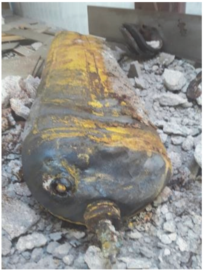
Remnant of yellow gas cylinder that struck a make-shift hospital in al-Lataminah on March 25, 2017 according to a Syria Civil Defense member.

While witnesses gave different information as to how many gas cylinders struck the hospital and surrounding area, there are photos of at least two different cylinders. Munaf al-Saleh from Syria Civil Defense shared a photo of a deformed yellow gas cylinder that he said was the one that had hit the hospital roof.<sup>22</sup> A reverse image search indicated that the photo had not been published online anywhere before.