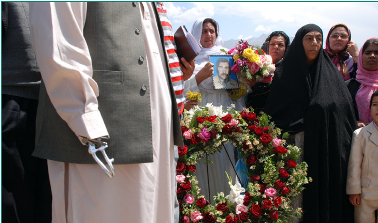
Image 1: Participants in the 2010 Victims’ Day memorial service

Ongoing efforts by international actors in supporting processes documenting past war crimes and human rights abuses and identifying and preserving mass graves are part of policies that confront the past. An accurate accounting of past crimes makes it embarrassing and difficult for official actors to deny them, applies pressure to remove perpetrators from power, and raises awareness toward preventing future abuse. 93 The Physicians for Human Rights (PHR) are helping build domestic capacity among the government and non-governmental actors 94 to register, position, secure and investigate graves, and to stop, where possible, the destruction of evidence documenting past abuses. In 2011, with the support of PHR, the Afghanistan Forensic Science Organisation (AFSO) was formed from government and non-governmental representatives who have received training to work on mass graves and promote forensic science in Afghanistan. The United States Institute of Peace is working to compile existing documentation into a single war crimes database and to train organisations in documenting war crimes. 95