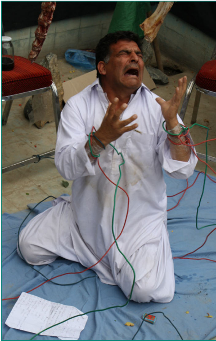
Image 2: Theatre performance in Kabul exploring transitional justice themes (by Jay Lamey)

increasingly confident and strategic, using media and key events as a platform to raise transitional justice issues. 96 The TJCG held a “Victims’ Jirga” in Kabul in May 2010, for the first time bringing together over 100 victims from all periods of the conflicts and from across Afghanistan. It was also the first time victims articulated a common position expressed in a final statement and to the media. 97 This was followed in March 2011 by a two-day National Victims’ Conference including representatives from government, civil society and victims’ and martyrs’ organisations from all the regions of Afghanistan. 98 These events assist developing an understanding and empathy about the past in order to create a shared understanding and trust, which is vital to reconciliation in Afghanistan.