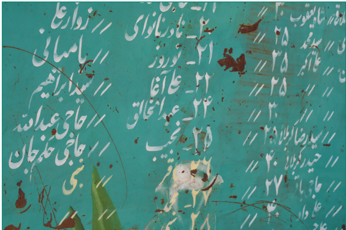
Image 3: Board listing names of victims of Taliban atrocities in Yakowlang District, Bamiyan Province (by Jay Lamey)

The overwhelming view of those supporting an official memorialisation process was that the presence of a designated place to pray or a remembrance day for victims would allow people space to remember, reflect and pray for the martyrs of the conflicts, which could assist healing processes. Other suggested ways of symbolically acknowledging victims suffering and paying them respect were to rename squares and streets in the names of ordinary victims or erect minarets or sculptures near previous sites of atrocity and genocide, former torture centres and, in particular, mass grave sites. Some of these commemorative activities are already taking place in the research sites. In Bamiyan, in the rural community two grave sites known to contain the bodies of Taliban victims are marked and tended by people of the area and a board listing the names of those who were killed by the Taliban marks the entrance to the valley. In the Bamiyan City site respondents described an annual ceremony marking the death of their martyrs. Meanwhile, the Kabul City research community holds an annual ceremony to mark the events of February 1993.