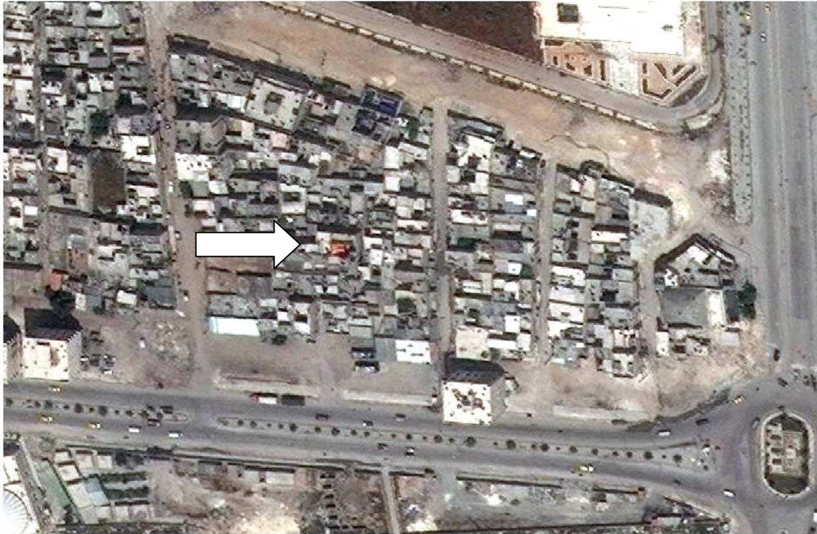
Digital Globe World View 1 – 13 May