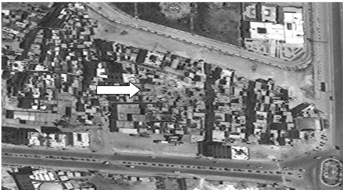
Digital Globe World View 1 – 27 July