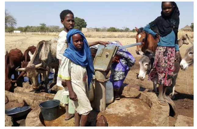
Returnee children at a water point in Um Dukhun locality (January 2017, UNICEF)

More information on returns to Um Dukhun locality is available in the Recovery, Returns and Reintegration (RRR) Sector Inter-agency Mission in Um Dukhun Locality. Central Darfur, January 2017 Report at this link.