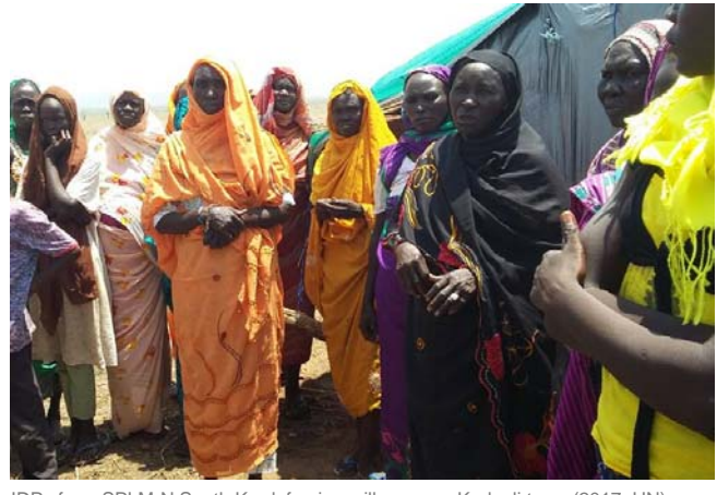
IDPs from SPLM-N South Kordofan in a village near Kadugli town (2017)

According to South Kordofan State government in state capital Kadugli, about 600 people arrive in government-controlled areas from SPLM-N-controlled areas, including Abu Safifa. Dalami and a