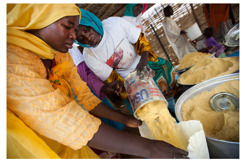
WFP food used in a nutrition centre in North Darfur (archive 2014, UNAMID)

As of December 2016, WFP had provided 9,670 metric tonnes (MT) of emergency food to 259,470 newly displaced individuals, including 31,760 IDPs who received 70MT of nutrition assistance. In addition, since the onset of the South Sudan crisis in December 2013, WFP has provided 46,900MT of emergency food and