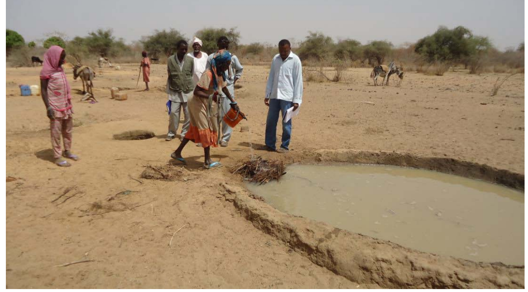
Shallow open wells are the only available water source in Baltebei, Umm Dukhun locality (2016, I-A mission)

According to the mission findings, returnees have poor access to basic services such as water, education, health and nutrition services. Returnees also lost their possessions when they fled and return without many belongings and lack income-generating and other livelihood opportunities necessary for effective reintegration in their village. Settlements are scattered within Umm Dukhun, posing a further challenge for the provision of services. In addition, to reduce tensions among/between communities, peace-building and reconciliation interventions are needed.