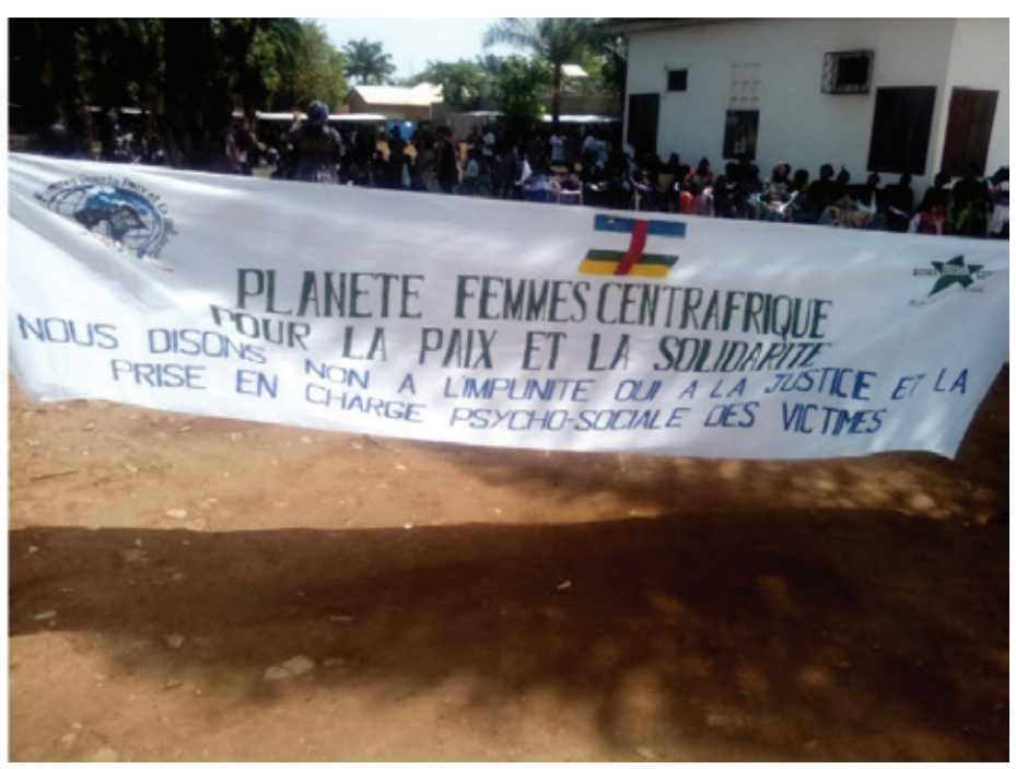
Participants to a workshop on justice for victims in the Central African Republic, March 2017