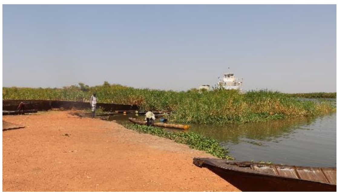
The river in Adok payam, Leer county, South Sudan, 6 February 2016.

"[After the attack began] we went to the river. The attackers came and found where she was hiding...but they didn't see the rest of us...They forced her to call out: 'The attackers left, come out,' but we knew she had been taken so we kept hiding ourselves...We heard when she was shot. When we did come out we found her and she was still alive. She told us what happened. She said they raped her before shooting her. She said: 'those people raped me,' and...she asked that we take care of her kids."