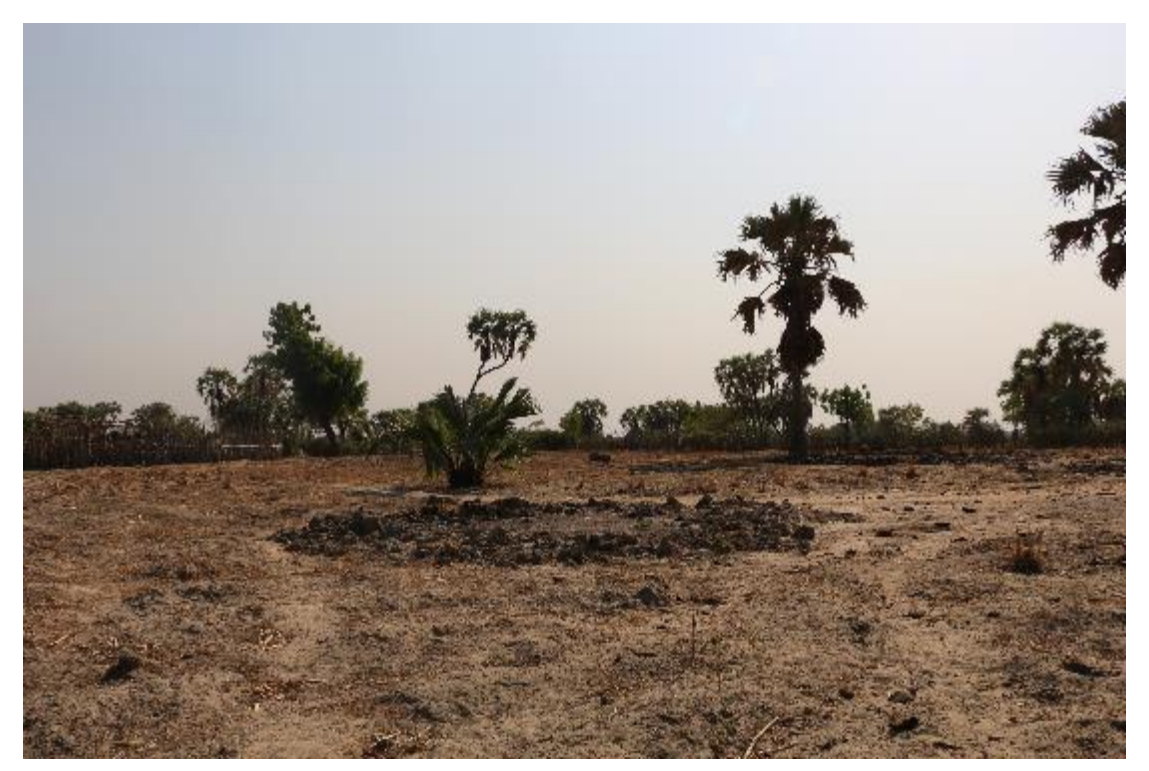
One of the homes that government forces burnt to the ground in Ding Ding, Leer county, South Sudan, 6 February 2016.