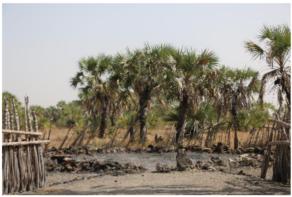
A home, burnt and looted by government and pro-government forces, Gandor payam, Leer county, South Sudan, 8 February 2016.

While physical insecurity no doubt contributed to the displacement of the civilian population from their villages in Leer county, many civilians explained that it was the burning of their homes, and the theft and destruction of food sources that caused them to eventually flee.