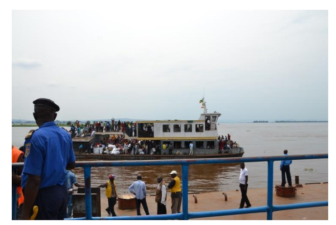
Boats ferried DR Congo nationals expelled from the Republic of Congo. During the peak days of the operation, 7,000 to 8,000 people arrived in Kinshasa daily.

Brazzaville and border crossing to the DRC, from where DRC nationals would take a boat to make the crossing back into the DRC. Those arrested and taken to ""the Beach by the police had no chance to challenge their deportations.