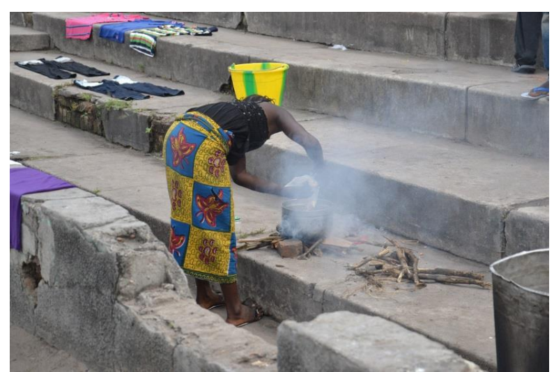
A woman prepares a meal on the terraces of Cardinal Malula Stadium in Kinshasa where many arriving from Brazzaville were initially sheltered.