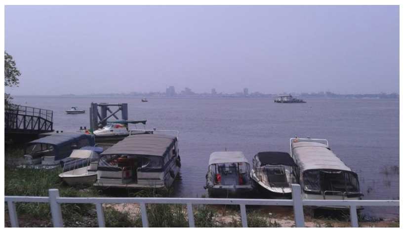
View of Kinshasa from the port of Brazzaville.

Although expulsions are not mentioned as a main line of action in the concept note describing the operation, Amnesty International's research demonstrates that the core of operation Mbata ya Bakolo consisted of mass expulsions of DRC nationals, mostly irrespective of their migration status. According to the government of the Republic of Congo, 158,724 families, that is about 245,000 DRC nationals, returned "voluntarily" to DRC during the operation.<sup>25</sup> According to the DRC government, operation Mbata ya Bakolo resulted in the deportation of at least 179,452 nationals of the Democratic Republic of Congo (DRC).<sup>26</sup> Over 40% of those registered in the DRC (73,614) were minors. At least 60 of them were refugees or asylum-seekers.<sup>27</sup> A number were migrants who were lawfully residing in the country.<sup>28</sup>