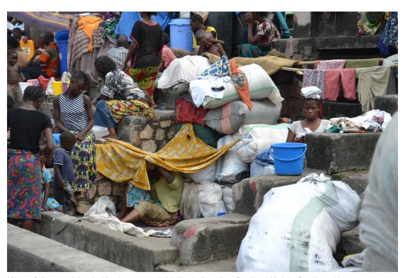
Many of those arriving in Kinshasa were initially sheltered at Cardinal Malula Stadium. Here, a woman uses a piece of fabric as a makeshift shelter.