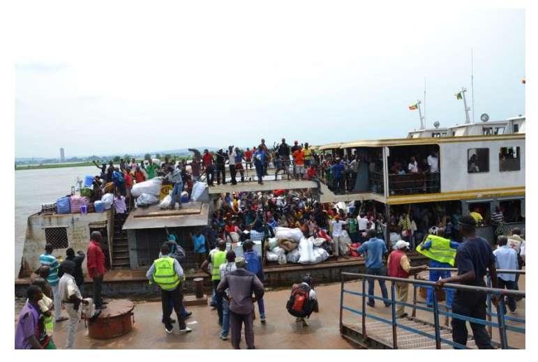
During operation Mbata Ya Bakolo , thousands of DR Congo nationals arrived back in the country every day. While some were able to return with their personal effects, this was not the case for all.

In the case of the Republic of Congo, the human rights violations and abuses committed in the framework of operation Mbata ya Bakolo and outlined in this report caused many DRC nationals to leave the country. Their returns constitute disguised expulsions, in violation of several international law obligations to which the Republic of Congo is bound, including: Article 33 of the 1951 Convention relating to the Status of Refugees; Article 3 of the UN Convention Against Torture; Article 13 of the International Covenant on Civil and Political Rights; Article 2.3 and 5.1 of the African Union Convention Governing the Specific Aspects of Refugee Problems in Africa; Articles 7 and 12 of the African Charter on Human and Peoples' Rights (see below).