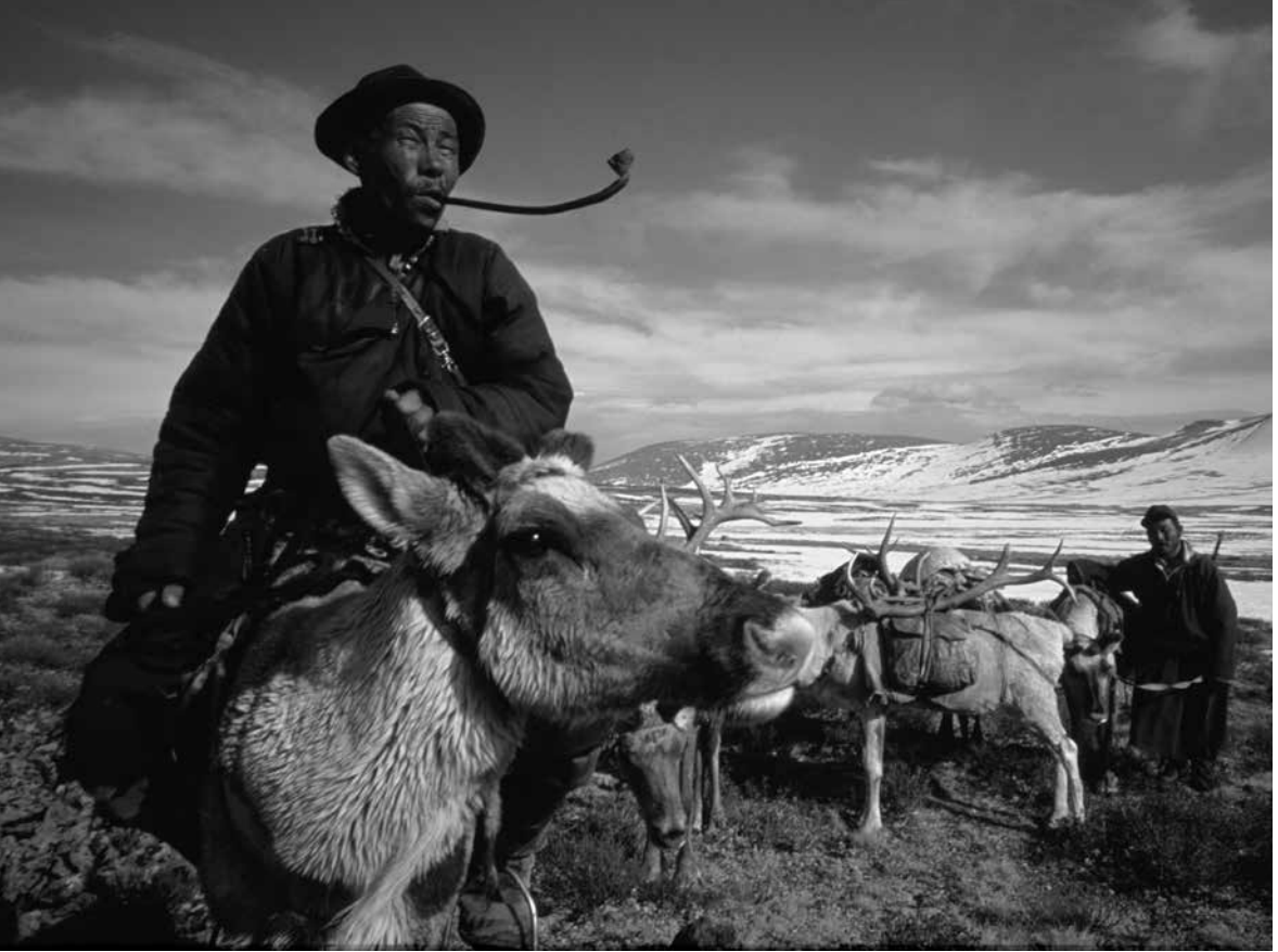
Above: Dukha people in Mongolia.

in the wake of a dzud – severe cold weather – which destroyed the livelihoods of thousands of Mongolian herders in 2010. This has included mental, reproductive and maternal health for women.