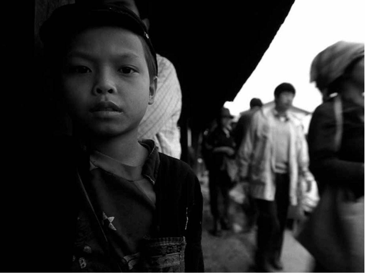
Above: Hmong boy at a market in Laos.

to the MLDH, ‘repatriated Hmong have been victims of imprisonment, re-education and discrimination’.