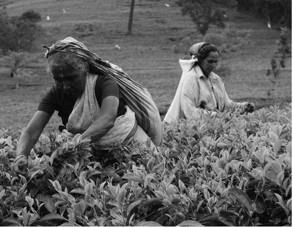
Above: Tamil tea plantation workers, Sri Lanka.