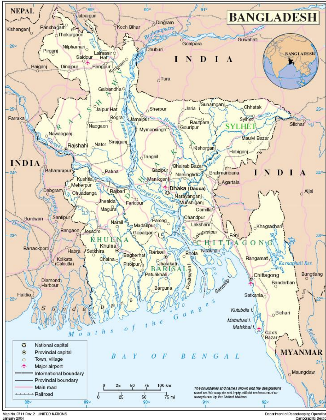
(United Nations Cartographic Section: Map no. 3711 ref.2, dated January 2004; edited by COI Service to show Sylhet and Rangpur Divisions.) 12

1.08 The map below shows the main cities and towns, and the seven divisions, of Bangladesh.