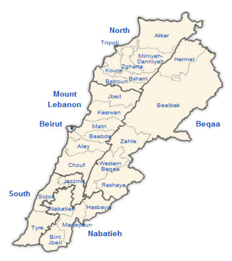
Map 2 – Akkar can be seen at the top of the map, Tripoli on the left near the top. <sup>26</sup>