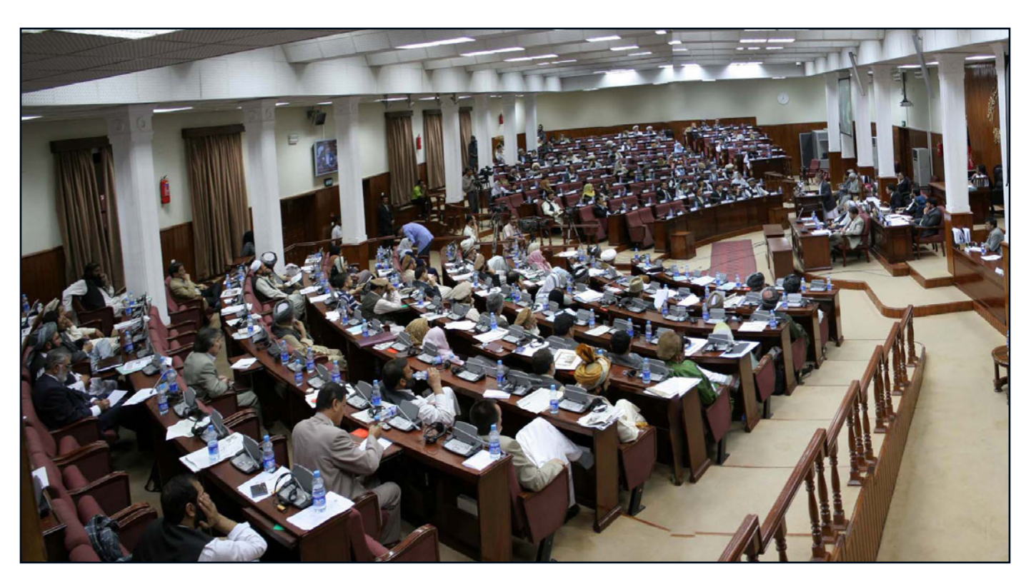
The Wolesi Jirga in session

been no growth of democracy, but instead the actions of the government and the MPs have defamed democracy. Now the people hate this type of democracy that has been demonstrated by the present government. Sixty-two million dollars were given for the electricity and power cables for our province but we don't know where this money has been spent...These government officials only try to cheat the people because their reports are completely opposite with what we see in practice.