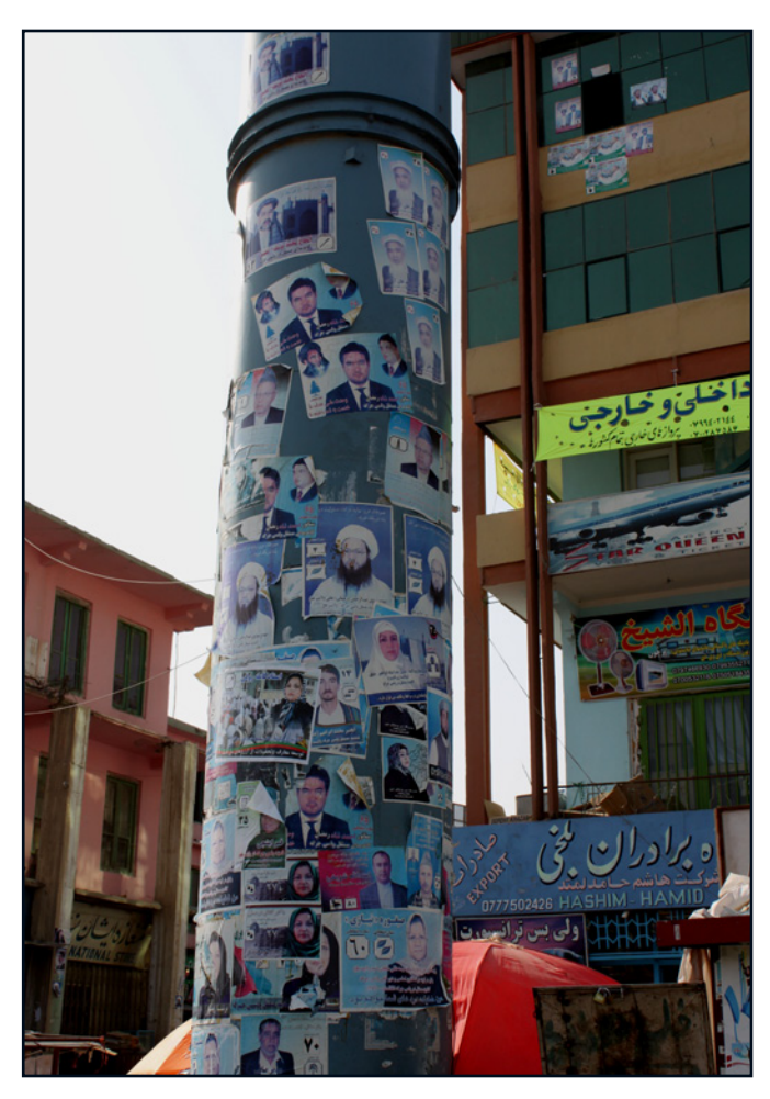
Campaign posters crowd street furniture in Mazar-i-Sharif, 2010

However, in statements about political parties, the problems raised appear to refer to broader concerns about the very principle of political competition, many respondents appeared genuinely concerned about the idea of competition between parties or groups in general. This is due in part to the legacy of conflict in Afghanistan, and the way threatened or actual violence has been used as a tool of political negotiation. This is also reflected in perspectives on regular stand-offs in parliament between the government and different groups who would now classify themselves as in opposition. When respondents in a related AREU project on parliamentary elections talked about the rise of the so-called "opposition," an overwhelming number stressed the need for reconciliation between the two groups in order to produce an effective, unified