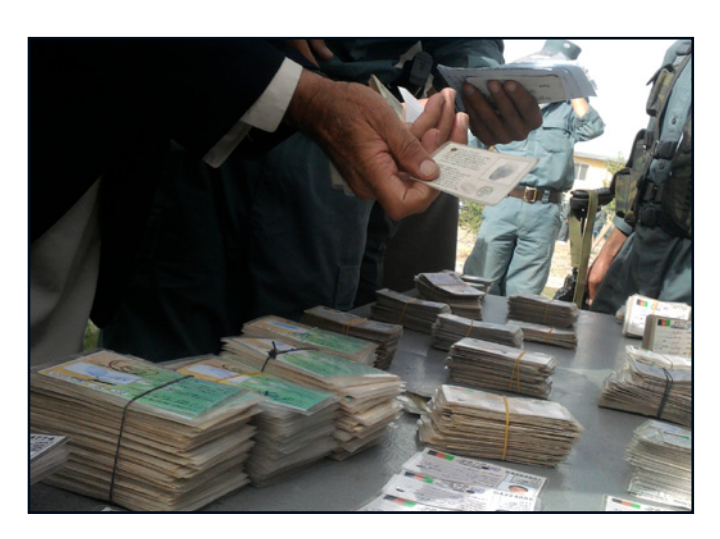
Officials examine evidence of fraud after 2010's parliamentary election

In the PC election last year there were some existing PC members and also some new candidates, but about 70 percent of the