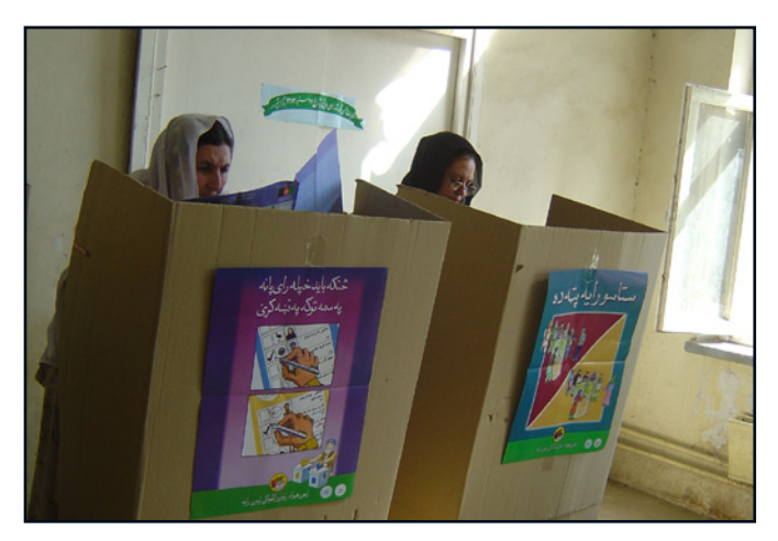
Women vote in 2009's presidential election

Dear sister, when you talk about democracy you mean freedom—but what kind of freedom do we have? I will tell you a story. My sister studied until 12th grade but my father then engaged her to a person who was very poorly educated. My sister insisted that she did not want to marry this person and asked her father if she could continue studying. She was not allowed to do this however and she was married to this person in [an insecure] district. It is years since we have seen her—my father and brothers