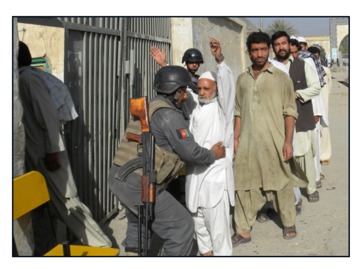
Police guard a polling centre in Kandahar during 2009's presidential election

Whereas "security" has been interpreted above to signify security from violence or intimidation, and security to go about daily activities without interference, "stability" is used here to denote a broader sense of continuity and dependability in political, economic and social life. It signifies a situation in which the "rules of the game"—for example in credit transactions, marriage practices, or elections—are widely known and perceived to be constant. Instability, by contrast, suggests a context where such rules are perceived as unstable or fluid by those involved—essentially, where interactions become unpredictable.<sup>71</sup> From a short-