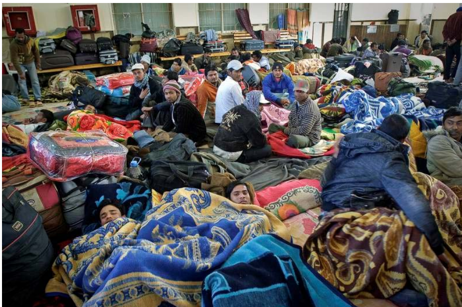
Bangladeshi migrant workers, some of them stranded for more than a week, in the arrival hall of Egypt's Sallum border post. / UNHCR / F.Noy/ March 2011

According to OCHA, the contingency planning figures in the flash appeal will be revised and a revised version of the Flash Appeal will be made available in two weeks time.