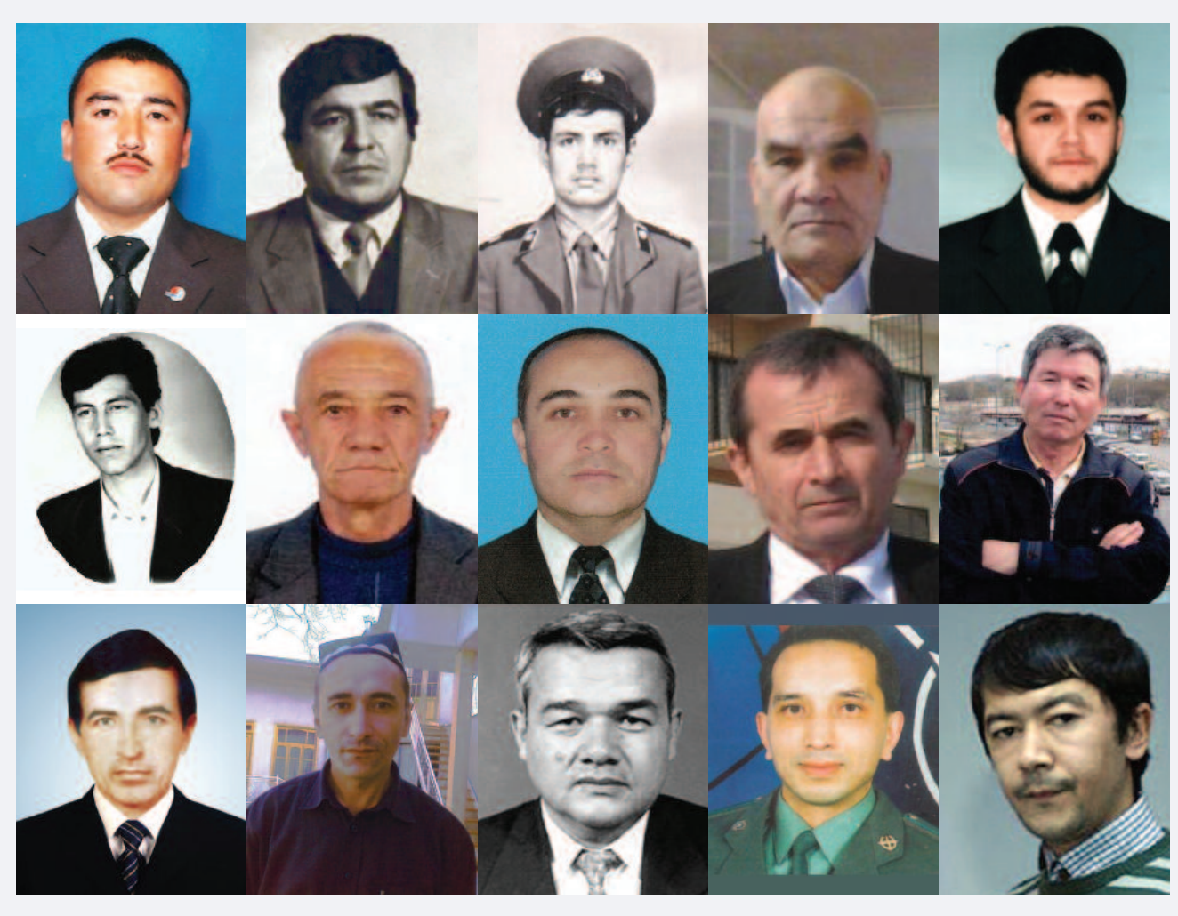
Individuals formerly or currently imprisoned on politically-motivated charges in Uzbekistan.

The government's campaign of religious persecution has resulted in the arrest, torture, and incarceration of thousands people.<sup>2</sup> Memorial, a leading Russian human rights organization that has monitored politically motivated imprisonment in Uzbekistan for many years, estimates that