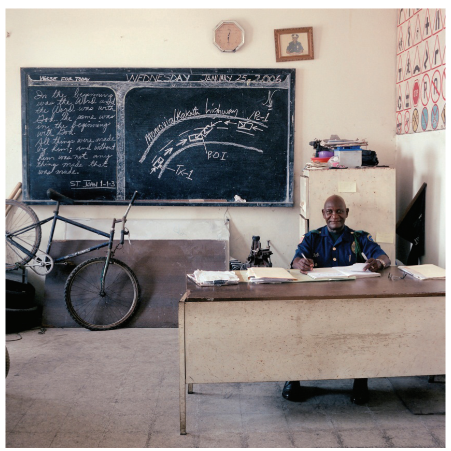
Police officer in the Reconstruction Room of the Traffic Police at the Liberia National Police Headquarters in Monrovia.

I feel so bad about it. Once I choose a career, I have to live with it. But as a human, I feel hurt. We love our country. We try to do our best to do the work.... In Liberia, police officers and teachers are the least.<sup>135</sup>