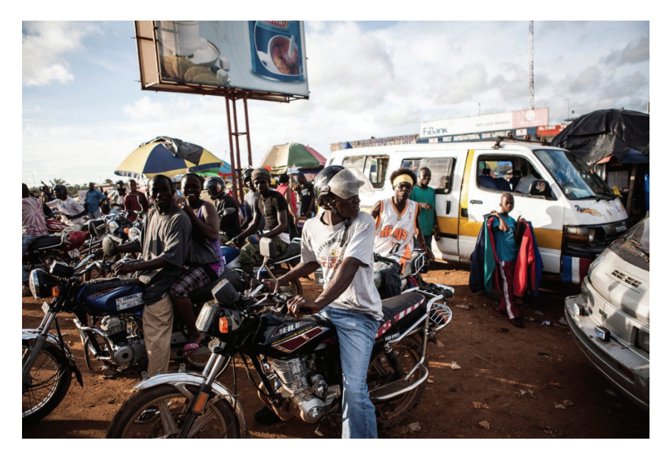
Motorcycle taxi drivers wait for customers in Red Light, Monrovia.

Motorcycle taxis have been an important source of income for young men who have low levels of education or have lost family in the wars. A number of them are ex-combatants from the civil wars: the motorcycle drivers union estimates that 25 percent of motorcycle taxi drivers are former fighters. 96 The motorcycle is how they sustain themselves and their families financially. 97