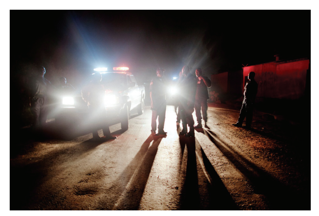
Police officers on nighttime patrol in Monrovia, Liberia.

The PSU, and sometimes the ERU, patrol Monrovia's impoverished West Point area at night and harass those found outside their homes. One man said that in October 2012 PSU officers robbed him and his wife at night outside their West Point home. The officers kicked him, held his wife at gunpoint, and seized money from her bra, he said.<sup>76</sup> The officers made off with their money and phones.