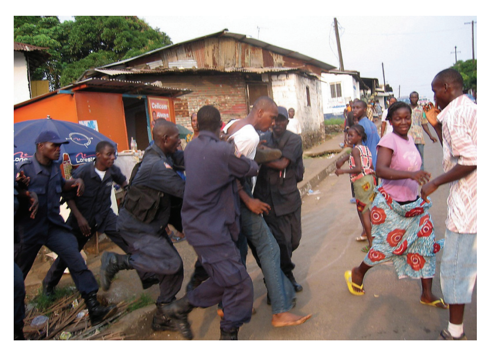
Police officers conducting an arrest in Monrovia, Liberia September 2006.

The government of Liberia has repeatedly acknowledged the links between human rights, a professionalized security sector, and human development. These links were seen most clearly in President Sirleaf's Poverty Reduction Strategy (PRS) from her first term. This strategy underscored the critical role that the security sector plays in Liberia's recovery and lasting peace: two of the four pillars of the strategy were security and rule of law (the other two were economic revitalization and infrastructure/basic services).<sup>39</sup>