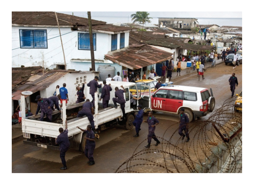
United Nations troops and the newly trained Liberian police force fan out in a neighborhood in Monrovia on September 14 2006, in an effort to quell increased crime in the city.

officers could continue in the force and to select eligible new recruits. United Nations Police (UNPOL) faced a number of challenges in recruiting, vetting, and training the new LNP, which undermined its ability to effectively identify and weed out abusive and corrupt officers.6