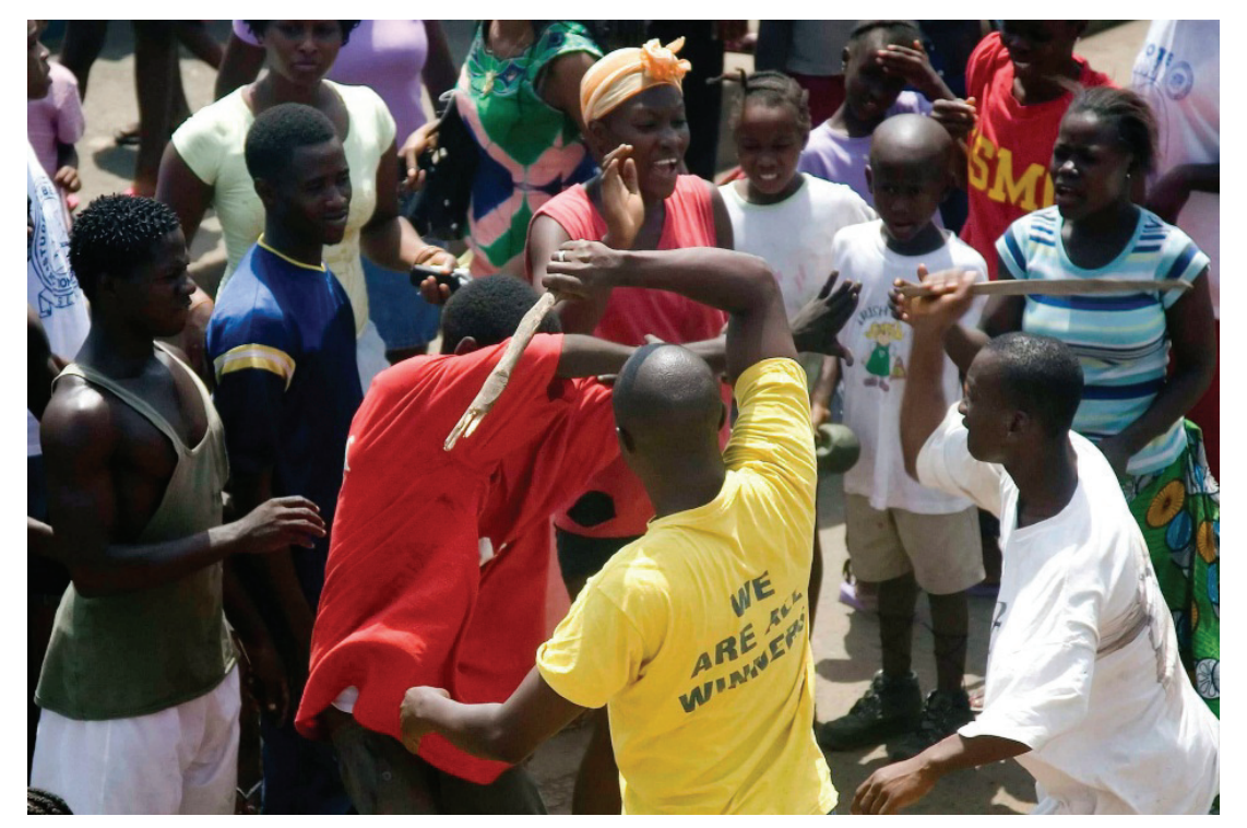
A young man is beaten with sticks after being accused of attempted theft in Monrovia, February 2007.