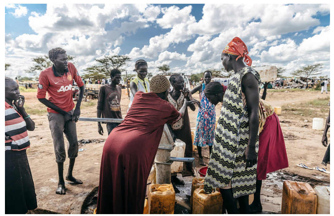
Local residents at a water point in the Abyei area (2016, IOM)

Meanwhile, funding for humanitarian activities is scarce, including in the health sector, and engagement is mostly limited to humanitarian assistance, except for quick-impact projects that are allocated by UNISFA. The International Organization for Migration, often in collaboration with international NGOs, helps with the implementation of quick-impact projects. The activities of international NGOs (funded directly by donors or through United Nations agencies) cover all sectors, including nutrition, water, sanitation, hygiene and livelihoods. These activities are conducted almost entirely in the central and southern parts of Abyei. Some United Nations agencies and two national NGOs are able to operate in northern Abyei, with support focused on the rehabilitation of public buildings/facilities and water points, community livelihoods and vaccination of livestock.