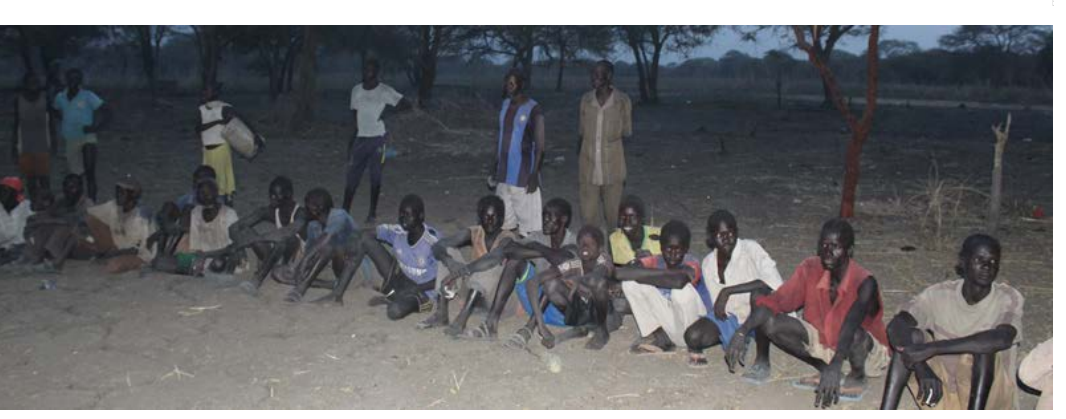
South Sudanese refugees in the Abu Simsim border area in East Darfur (March 2017, Sanad Charity)