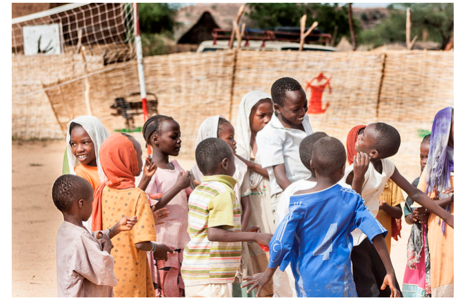
Children at a child-friendly space run by Save the Children in Darfur

The funds will enable some 95.000 children under the age of