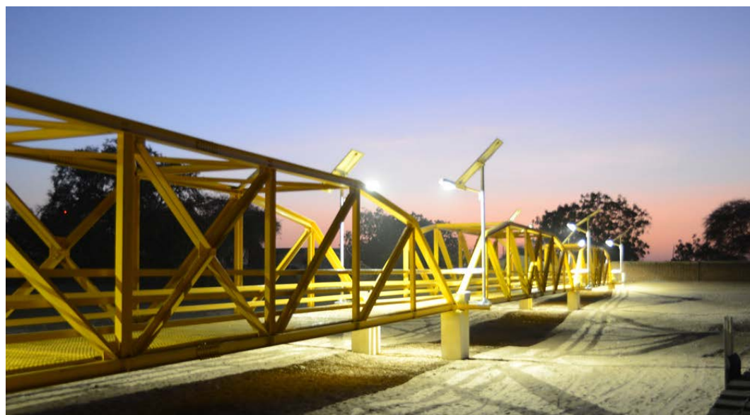
Pedestrian bridge in Ed Daein (East Darfur) constructed with funds from the SHF

In 2016, SHF allocated about $39 million to 47 humanitarian partners in Sudan.