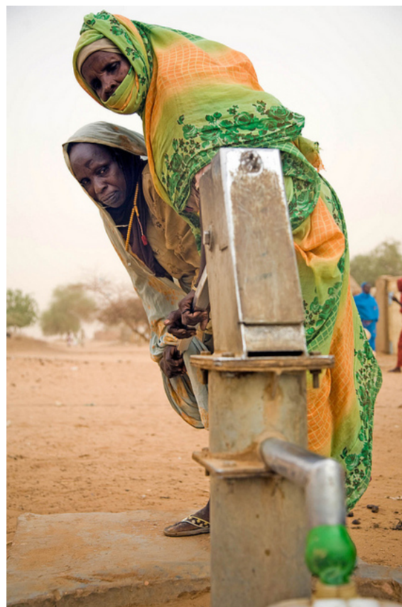
Women at a water pump in North Darfur