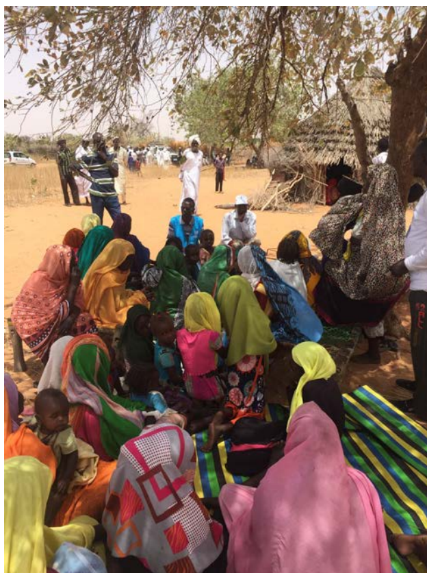
New IDP arrivals from East Darfur in El Lait North Darfur (Mar 2017, IA mission)

Aid organisations are continuing to assist people in need in a number of areas of the Jebel Marra massif located in Central Darfur. Humanitarian partners are currently waiting for the results of an IOM and HAC registration exercise, to determine the accurate