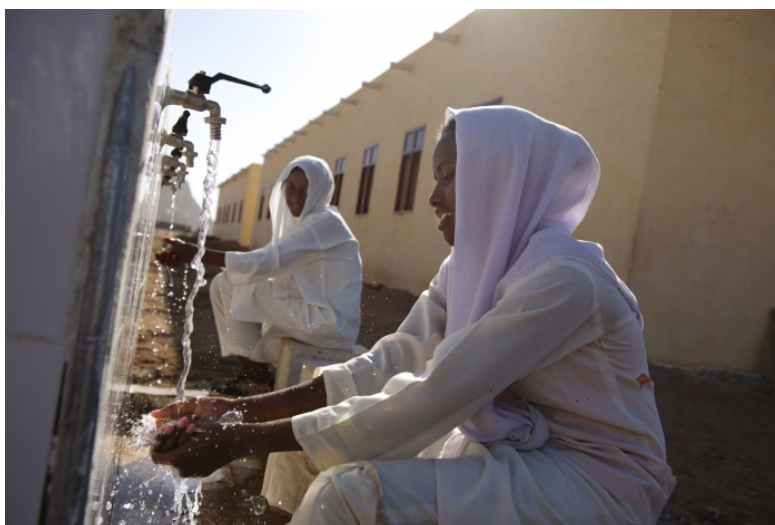
Girls wash their hands in a child-friendly space in Kassala, eastern Sudan (UNICEF)

In Sudan, 68 per cent of households have access to basic improved water, with disparities in access between rural and urban populations at 64 and 78 per cent respectively, according to a statement issued by the UN Children's Agency (UNICEF) for World Water Day. There are also disparities