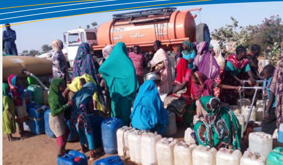
South Sudanese refugees in a camp in Darfur (Jan 2017, CIS)

58.3% Reported funding (as of 26 March 2017)