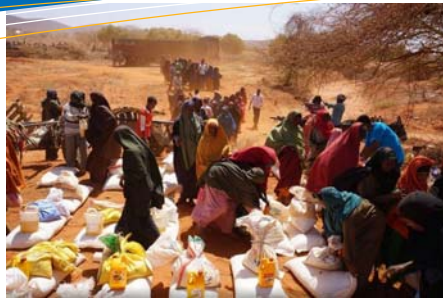
Humanitarian partners are scaling up response in Somalia.