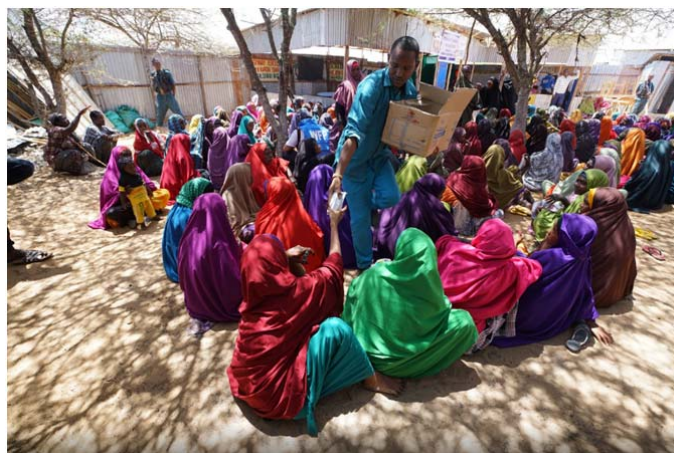
Drought-affected people are in need of life-saving assistance

The Logistics Cluster is mobilizing dedicated air assets to facilitate the airlift of 100 cubic meters of urgent cargo to locations across Somalia, including Luuq, Diinsoor, Wajid, Baidoa, Belet Weyne, Hudur, Bardhere and Dolow. This is in addition to over 500 metric tonnes of food transported to hard-to-reach destinations such as Diinsoor, Wajid, Garbahare, and El Barde. The Cluster is also assisting humanitarian agencies to ship humanitarian supplies on a monthly basis from Mombasa to Mogadishu, and/or Berbera/Bossaso/Kismayo. This has ensured a more predictable and regular delivery to all functional Somali Ports.