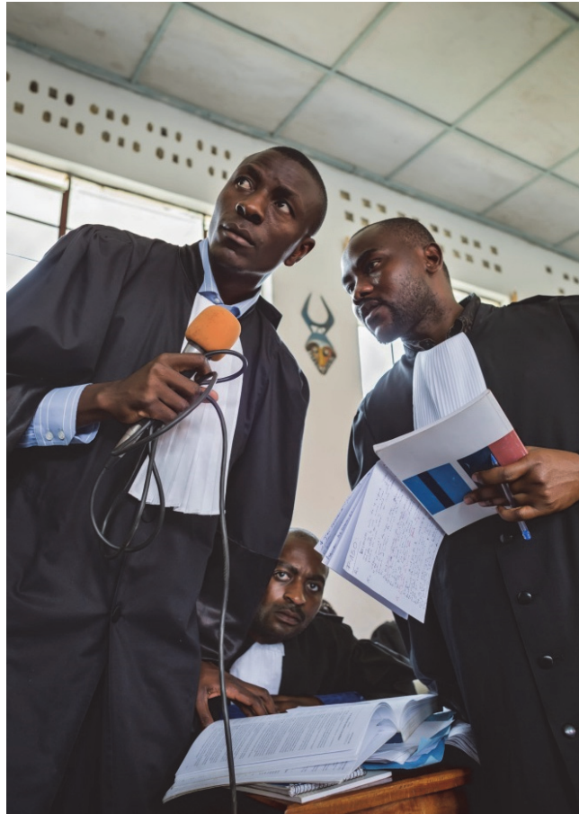
Defense lawyers listen to testimony during the Minova rape trial.

None of the defendants in the Minova case had access to a lawyer during investigations, including when they were formally interrogated. This was contrary to article 19 of the Congolese Constitution, which states that an accused person should have access to legal assistance at all stages of the criminal proceedings. 90 The defense lawyers noted that this created difficulties and contradictions later during the trial. 91