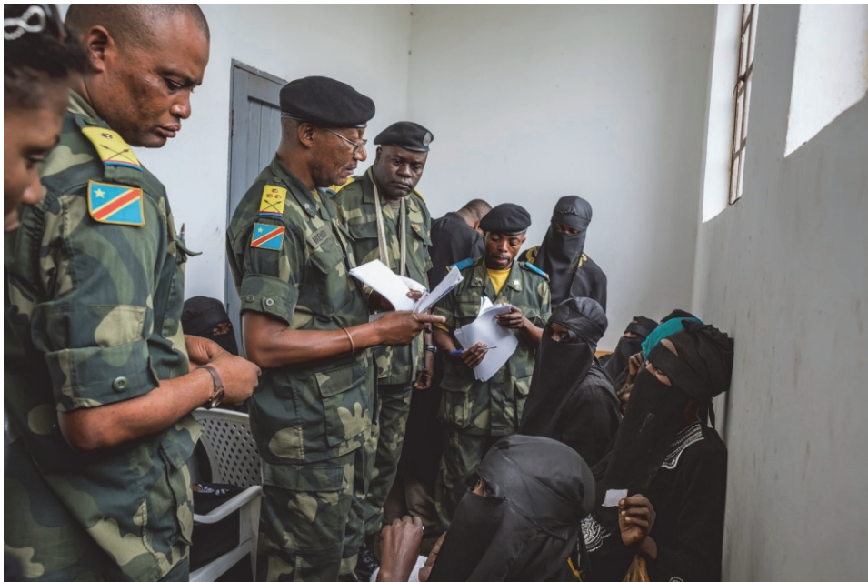
Judges and other judicial officials of the Operational Military Court meet with victims in a waiting room before the day's testimonies begin.

At trial, the victims' lawyers were allowed to question witnesses, they collaborated with the judges to identify which victims were best placed to give testimony in court, and they facilitated their appearance in court. 198 Non-governmental organizations organized and paid for the transportation of all victims who came to testify in the trial, both in Minova and Goma, while the UN Joint Human Rights Office covered costs for accommodation and meals. One of the victims' lawyers said: "Victims' participation in trials for serious international crimes would not be possible without ASF and ABA."