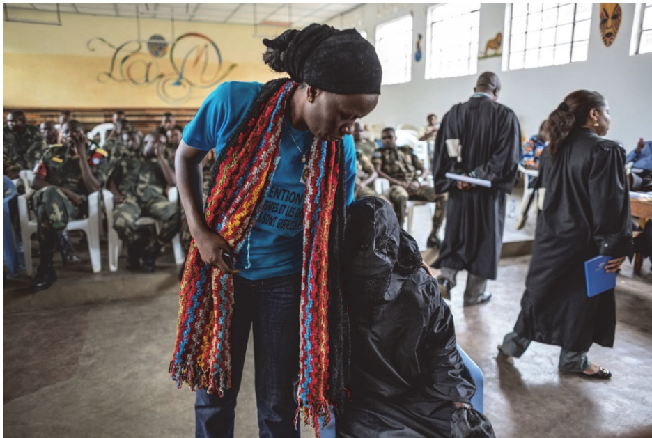
A psychologist comforts a woman before she testifies about having been raped at the Minova trial.

While the long-term solution is to strengthen Congo's prison system, it is important in the short term to set up an alert mechanism at the prison in Goma so that any relevant escape could be immediately reported and measures taken to protect anyone at risk. A national specialized protection program, which could be created with the assistance of MONUSCO, could assume protection responsibilities in international crimes cases.