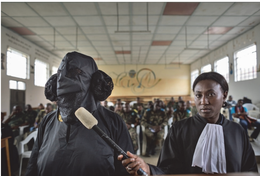
A woman —veiled to protect her identity from the public— testifies about having been raped at the Minova trial. A lawyer holds the microphone for her. Accused soldiers are seated in the rear.

According to the military justice staff that Human Rights Watch interviewed for this report, they did not experience threats or intimidation from soldiers and officers in this case 171 —often a challenge in cases involving the army. 172 Preventative protection measures to ensure the security of victims and witnesses were taken at the investigative phase. For example, in late January 2013, ahead of an upcoming investigative trip by military justice officials, two international organizations, the American Bar Association and Avocats sans Frontières (ASF), and the protection unit of MONUSCO conducted a protection evaluation mission in Minova. 173 MONUSCO’s protection unit also conducted protection trainings for all participants in the trial. 174