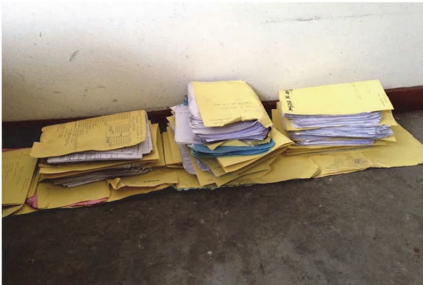
Only one paper copy of the Minova case file exists, pictured here on the floor at the Operational Military Court.

Supporting monitoring activities by non-governmental organizations and the media could also help strengthen the quality and independence of national proceedings. For example, in the Minova case, a local NGO trial monitor said: “The judges knew they were under scrutiny, from us and from the international community; this put pressure on them to conduct good proceedings.” 292