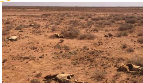
Livestock deaths have been reported as the drought situation continues to deteriorate, especially in the north.