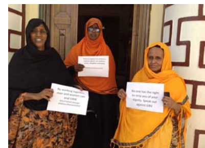
Somalia joined the globe in marking 16 Days of Activism