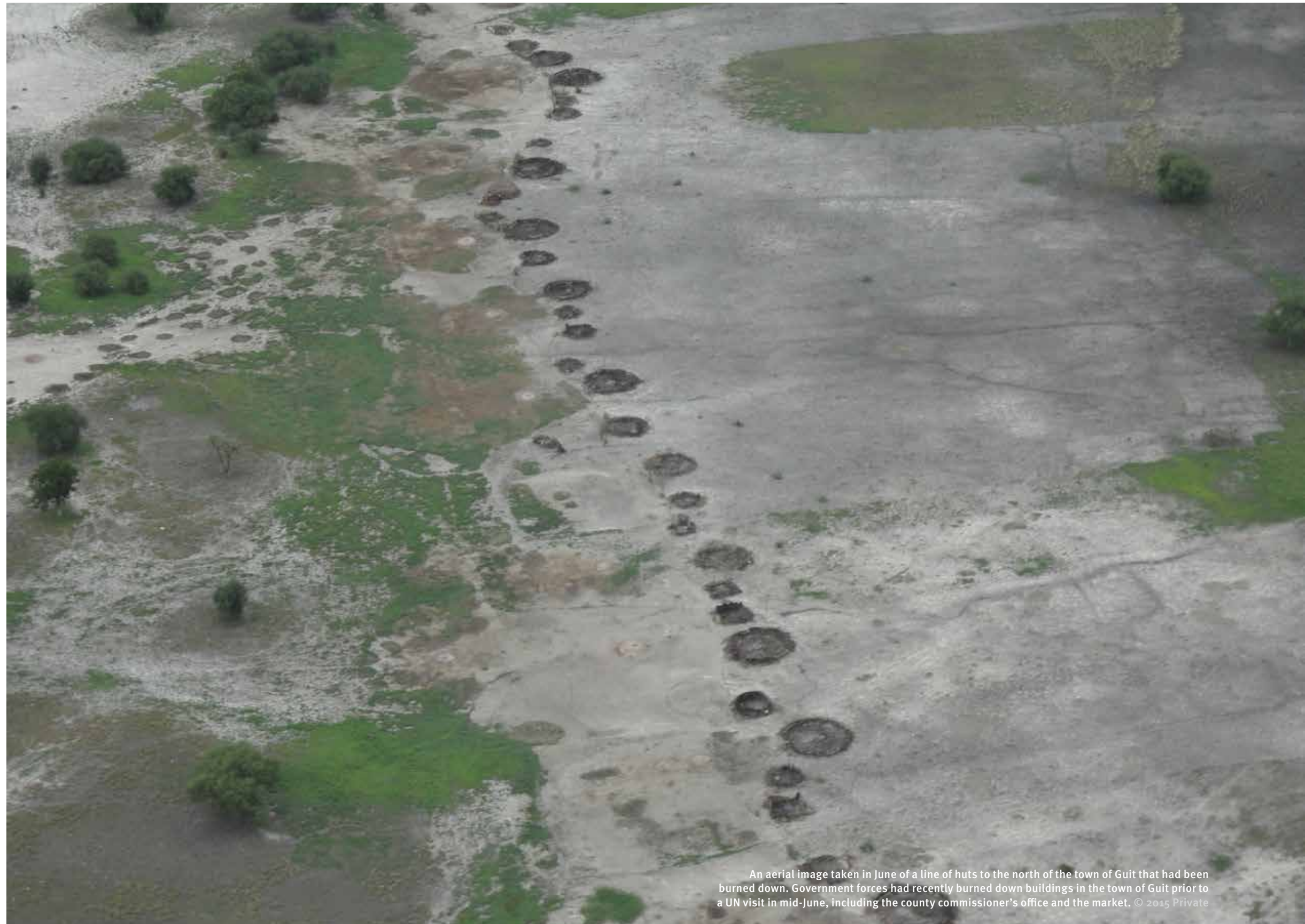
An aerial image taken in June of a line of huts to the north of the town of Guit that had been burned down. Government forces had recently burned down buildings in the town of Guit prior to a UN visit in mid-June, including the county commissioner’s office and the market.

However, the patterns of attacks documented by Human Rights Watch—the repeated burning of homes and