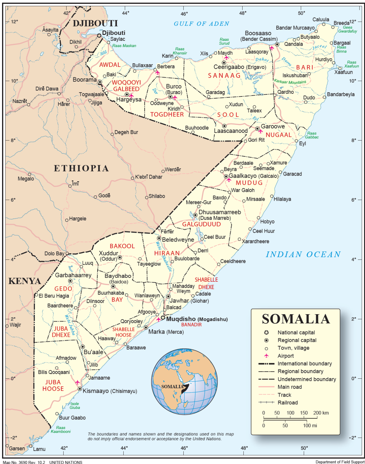
Map No. 3690 Rev. 10.2 UNITED NATIONS May 2014