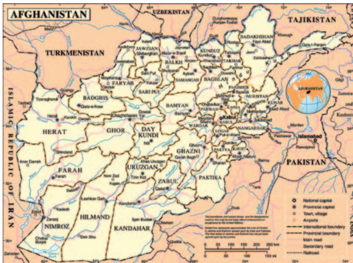
Figure 1: Map of Afghanistan (8)