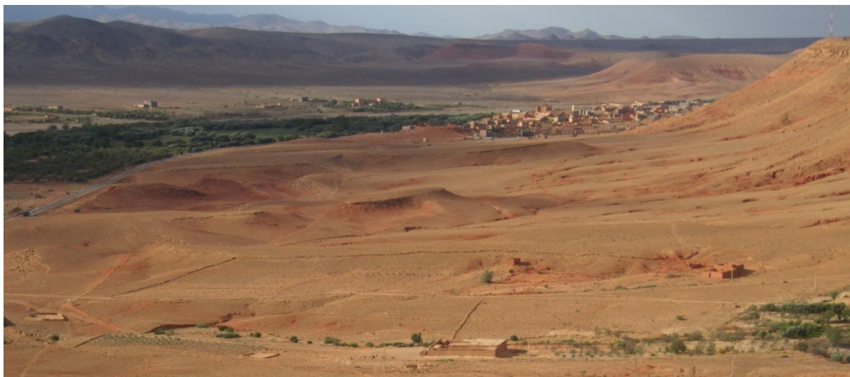
Le village de Imider, vue générale

Imider est une petite commune posée au pied du Haut-Atlas, à quelques 300 km au sud-est de Marrakech, entre Tinghir et Boumaln-N-Dadès, sur la N10, l'axe routier reliant Warzazat à Errachidia. C'est une zone désertique parsemée de petites localités dont l'existence est intimement liée à la présence de l'eau. Environ 5000 habitants vivent dans les 7 villages de cette commune (Ait-Mhend, Ait-Ali, Ait-Brahim, Anou N Izem, Izoumken, Taboulkhirt et Ikis), essentiellement de l'activité agricole vivrière (maraichage et petits élevages). Les habitants de cette région sont des Amazighs.