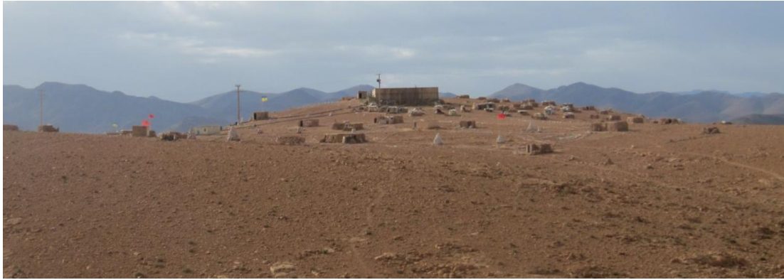
Bassin d'eau de la SMI sur le mont Aleban et campement des habitants d'Imider