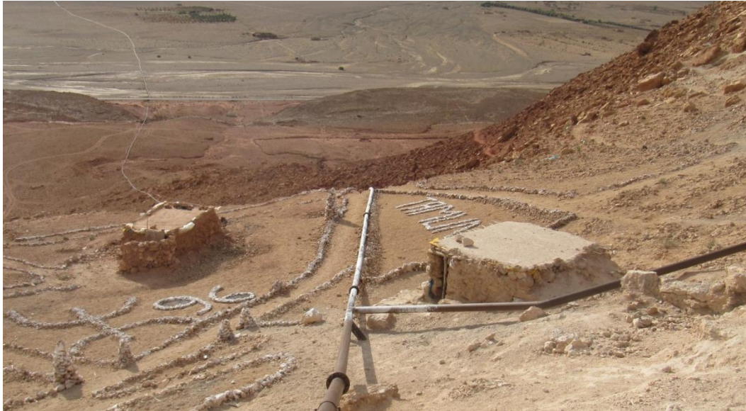
Canalisations acheminant l'eau vers la mine