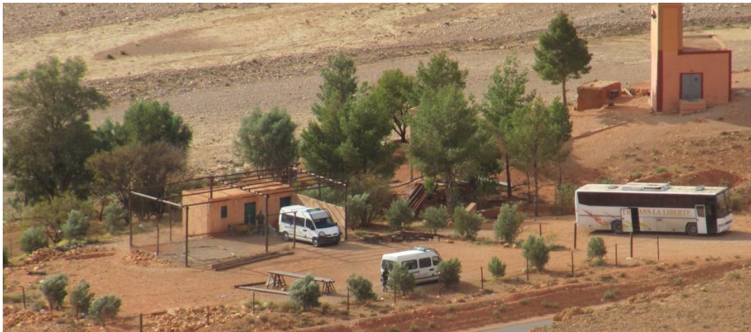
Un des puits alimentant la mine, gardé par les soldats de l'armée royale marocaine

De nouvelles réunions ont eu lieu entre les représentants de l'Agraw et ceux de la SMI, en présence des autorités locales, mais sans résultat. A partir de ce moment, les autorités marocaines décident d'utiliser la manière forte dans le but de décourager, puis de déloger les habitants du mont Aleban et de libérer la conduite d'eau fermée.