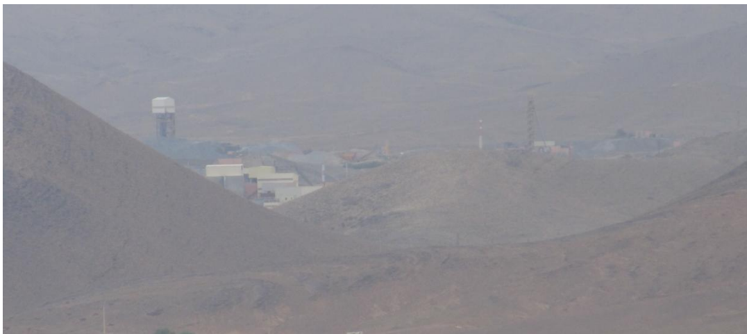
Installations de la mine d'argent exploitée par la SMI, à 3 km de Imider

Depuis 1969, la Société Métallurgique de Imider (SMI) exploite un gisement d'argent sur les terres collectives des habitants de Imider, puise dans la nappe phréatique l'eau nécessaire au traitement du minerai, rejette des polluants et n'apporte aucun avantage pour la population locale, pas même l'emploi des jeunes au chômage. Ces dernières années, les paysans de Imider ont constaté le recul des niveaux d'eau très inquiétants, de près de 60%, jusqu'à rendre inexploitable certaines parcelles productives jusque-là. Des champs d'arbres fruitiers ont ainsi été perdus faute d'eau. D'après les constats, l'appauvrissement de la ressource hydrique est due au pompage excessif effectué par la SMI. Plusieurs canalisations partent de plusieurs puits et convergent vers la mine qui consomme de grandes quantités d'eau. La mine utiliserait 1555 m 3 d'eau par jour, soit plus de 12 fois la consommation journalière de tous les habitants de Imider. Si la situation devait perdurer, elle menacerait directement la vie dans cette localité.