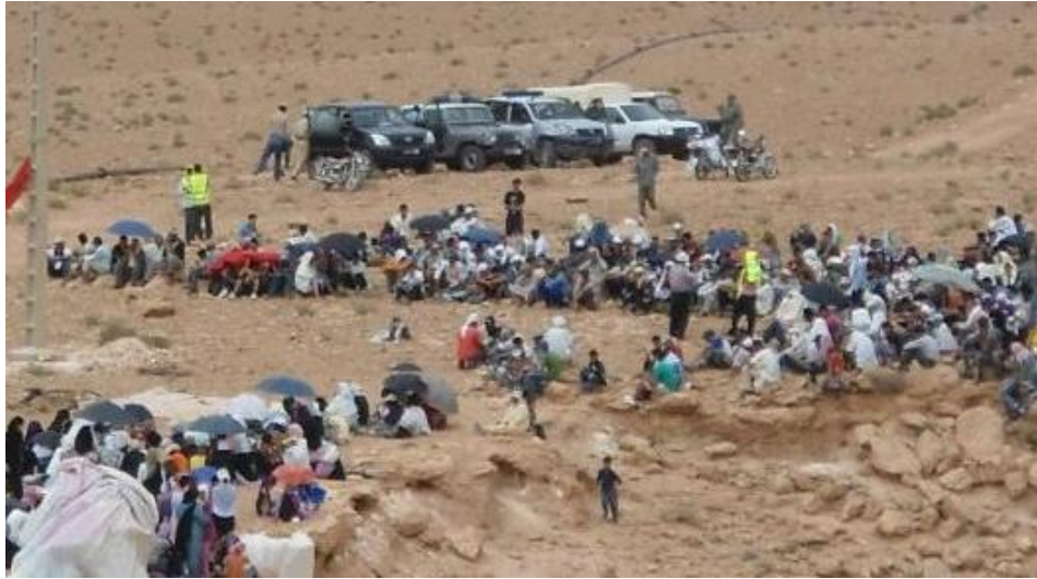
Sit-in de la population sur le mont Aleban sous la surveillance des gendarmes et du personnel sécurité de la SMI.

Au cours du mois d'octobre 2012, une autre tactique a été utilisée par les autorités locales de Imider et Tinghir en collaboration avec la direction de la SMI, afin de casser le mouvement de protestation qui est resté ferme et uni malgré 15 mois de résistance dans des conditions très hostiles. Les représentants de l'autorité de l'Etat et ceux de la firme SMI ont eux-mêmes choisi de faux-représentants des habitants et ont fait mine d'entamer avec eux un pseudo-dialogue. Cette méthode a été aussitôt dénoncée par les représentants légitimes de l'Agraw, qui ont mis en garde les autorités contre ce procédé à la fois malhonnête et qui menace la paix civile.