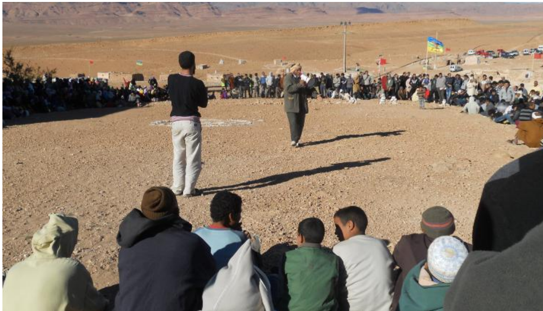
Agraw, l'assemblée des habitants de Imider

Prenant conscience des conséquences néfastes des conditions d'exploitation de la mine, les habitants de Imider se sont réunis le 1/08/2011 pour réclamer une étude scientifique indépendante sur les externalités négatives produites par la mine, la mise en place par la SMI de dispositifs capables de réduire la pollution, réduction de la quantité d'eau consommée par la mine, investissement d'une part des bénéfices dans la création d'infrastructures sociales et l'embauche prioritaire des chômeurs locaux. La question de la l'illégalité de l'occupation des terres collectives par la mine a également été posée.