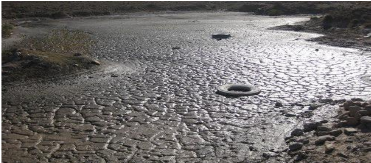
rejet de l'eau polluée par la mine

Par ailleurs, les paysans ont constaté plusieurs effets de la pollution générée par l'exploitation du gisement d'argent. Les eaux usagées rejetées par la mine sont hautement chargées de plusieurs composants très toxiques tels que le cyanure et le mercure et stockées à ciel ouvert. Ces eaux empoisonnent les oiseaux et les animaux et s'infiltrent dans la nappe phréatique et la contaminent, ce qui a provoqué la perte de plusieurs têtes de bétail et des maladies de la peau constatées chez les habitants d'Imider. Dans le futur proche, des maladies graves sont à redouter et la vie animale, végétale et humaine est très sérieusement menacée.