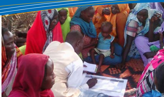
Returnee registration in Habila locality, West Darfur (IOM, 2016)