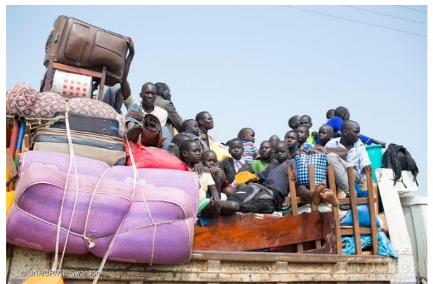
South Sudanese refugees, many of them young boys, arrive at the collection centre in Elegu, Uganda.