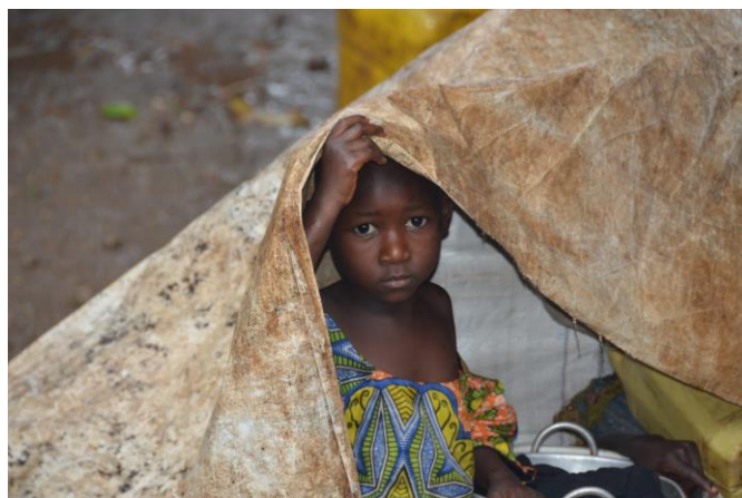
A young child in Kagunga waiting to be transferred to Kigoma and then onwards to Nyarugusu camp.