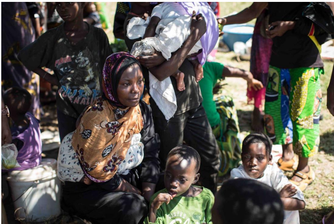
A mother rests with her children on the shore of Lake Tanganyika in the Democratic Republic of Congo after a grueling 22-hour boat journey to reach safety.