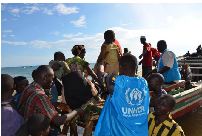
UNHCR assists a child board one of the small fishing boats used to ferry refugees to a ship that will then transport them to Kigoma.