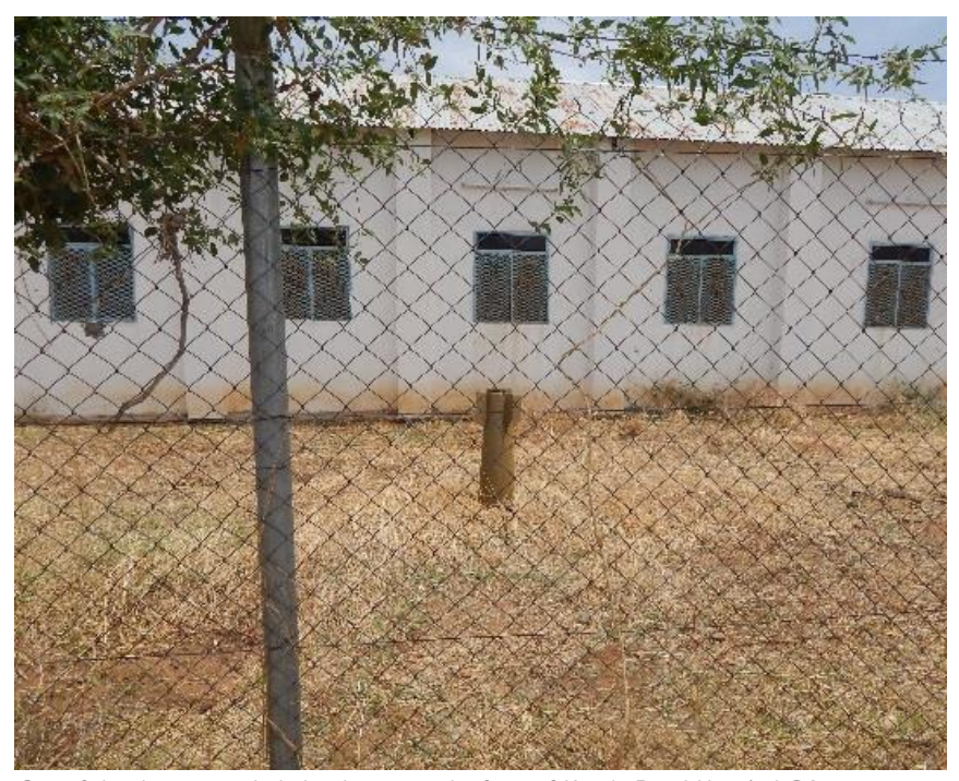
One of the three unexploded ordnance at the front of Kauda Rural Hospital

Amnesty International researchers inspected three unexploded ordnances at the Kauda Rural Hospital. The unexploded ordnances are indicative of a parachute retarded high explosive bomb. Witnesses said that the hospital was attacked on 28 May 2014, the same day as the attack at the Saint Peter and Paul School in Gidel. One of the ordnance, nose down in the ground, is on the grounds of the hospital, behind the chain link fence that surrounds the property and less than three meters from one of the hospital buildings. The other two ordnances are just outside the fence, no more than 20 meters distant. Fortunately since they did not explode there was no loss of life, injury or damage to property. The hospital was not operational at the time, having been evacuated several months earlier because of fears of a possible attack. It remains closed.