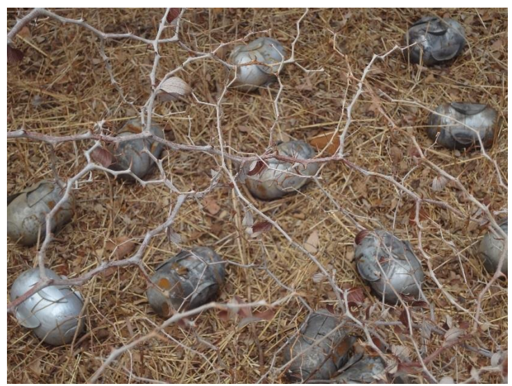
Evidence of unexploded cluster bomblets in Umm Dorain County

Amnesty International has also confirmed the use of cluster munitions and the resulting presence on the ground of unexploded cluster bomblets at four sites in two separate locations in Dalami and Umm Dorain Counties.