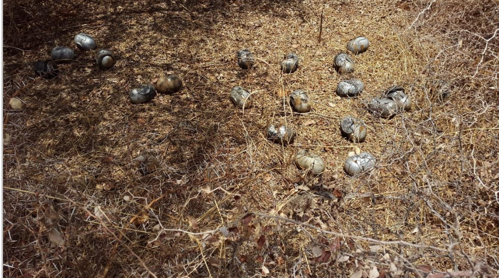
Unexploded cluster bomblets in Rigivi, Umm Dorain County

Since the Sudanese Air Force's acquisition from Belarus in 2013 of Sukhoi Su-24 ground attack aircraft they have been using parachute bombs with increasing regularity in South Kordofan. Those documented previously have been Soviet/Russian origin FAB-500 series bombs. The size and dimensions of the crater along with the remains of charred fabric straps at the site of a bomb dropped outside the Kauda Peace High School for Girls in February 2014 are indicative of a parachute retarded aerial bomb of around 500 kilograms. Similarly, the unexploded bombs on and immediately outside the grounds of the Kauda Rural Hospital are indicative of a parachute retarded high explosive general purpose bomb of between 400 and 500 kilograms. Stencilling visible on one of the weapons, if correct, suggests that it was probably manufactured in the 1960s. On the basis of the script and the lot numbering, it is possible that these are Chinese-manufactured parachute-drag tail assemblies.