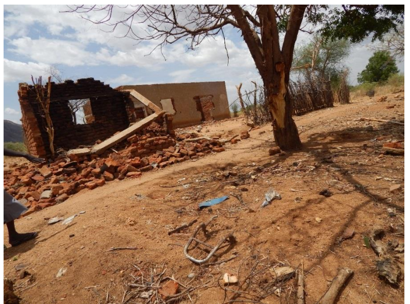
Six children were killed in this house on 16 October 2014 in Heiban town, Heiban County

Children have frequently been killed and injured in attacks in South Kordofan. On 16 October 2014, a bomb hit a house in the village of Heiban in Heiban County in which seven children between the ages of five and 12 were hiding. Six of the children were killed immediately or died shortly after the attack from their injuries. Only one child survived the injuries sustained during the attack. The children's mother was farming in a nearby field at the time.