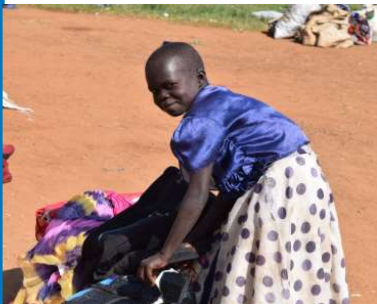
A refugee girl taking care of her Luggage at Elegu Collection Point.