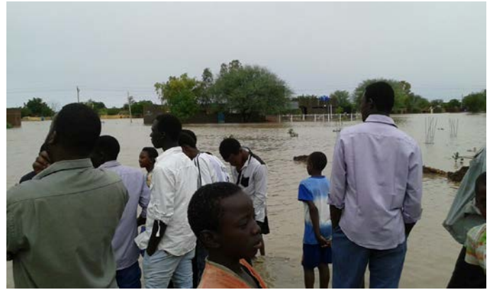
Flooding has affected thousands of people in Sudan (2016, SRCS)

Efforts are ongoing to verify the number of people affected, identify their needs and obtain an overview of the response to date. The government-led National Flood Task Force in coordination with key actors is continuing to monitor the impact of rains and flooding and coordinate the response. Government authorities, local communities and in some areas national and international humanitarian organisations are responding to the needs arising from heavy rains and flooding.