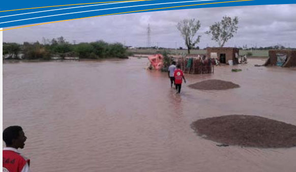
A flooded area in Al Gezira State (2016)