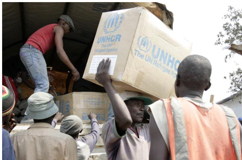
Distribution of food and NFIs in Lusenda, DRC.