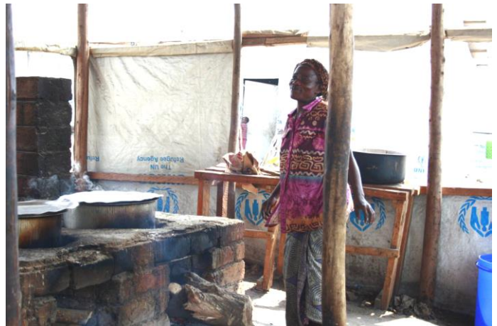
Preparation of hot meals in Lusenda's common areas.